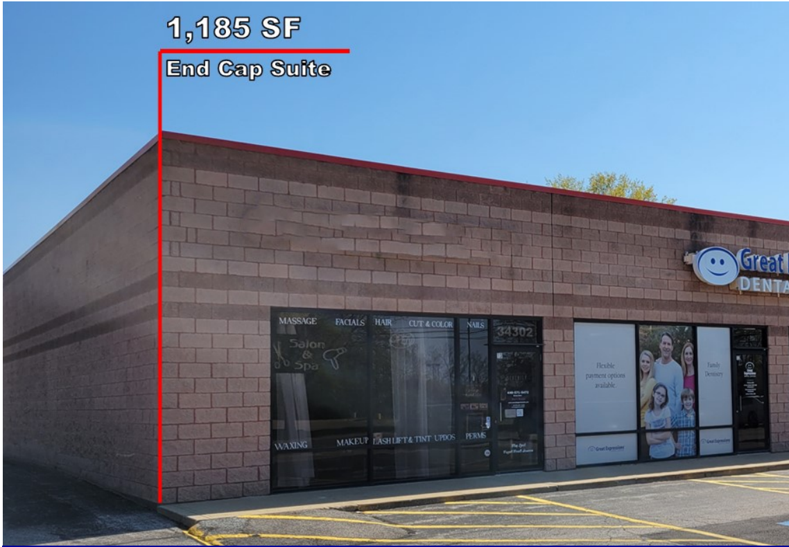
1,185 SF End Cap Suite