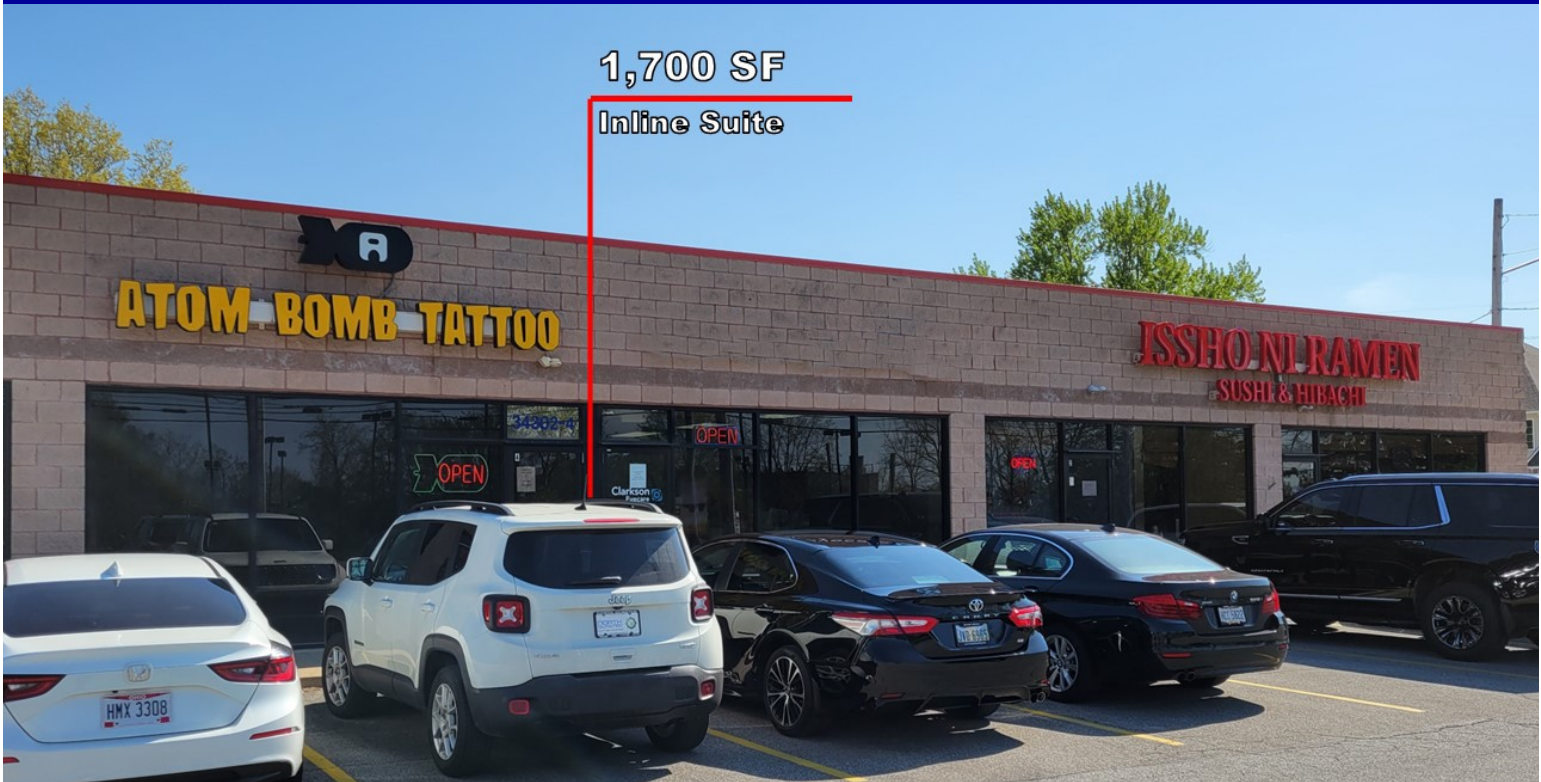
1,700 SF Inline Suite

★ ★ ★ Retail Suites for Lease in ★ ★ ★ ★ ★ ★ ★ ★ ★ ★ ★ ★ ★ ★ ★ ★ ★ ★ ★ Busy Neighborhood Center ★ ★ ★