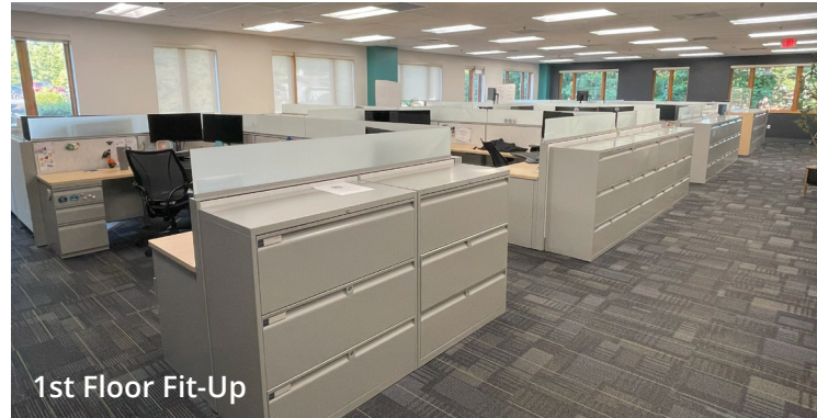
1st Floor Fit-Up