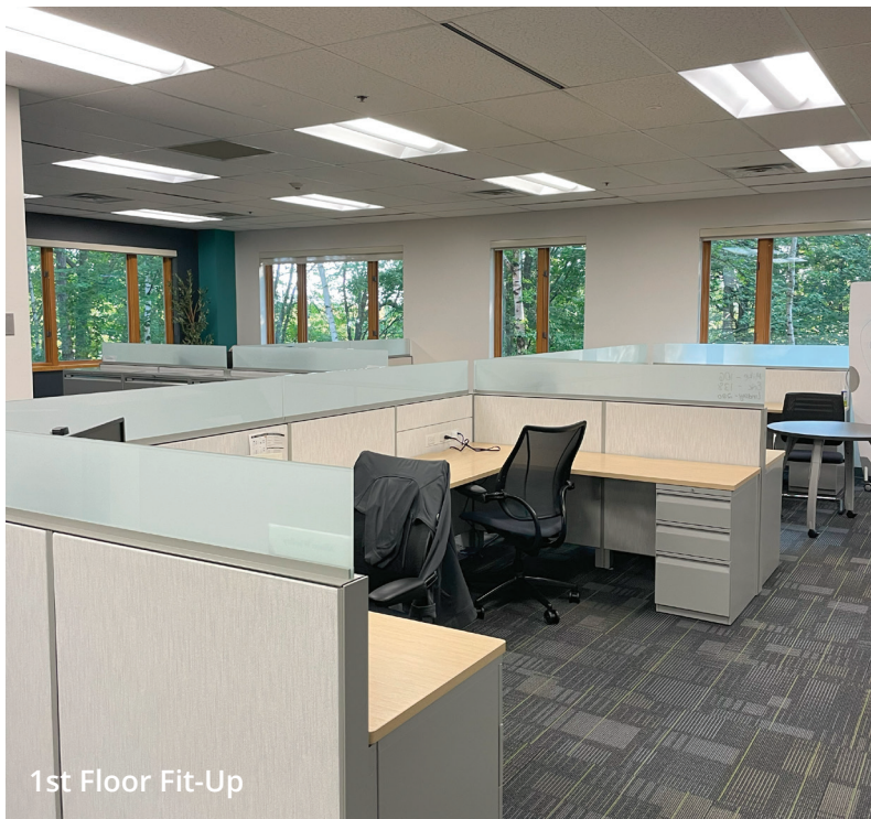
1st Floor Fit-Up