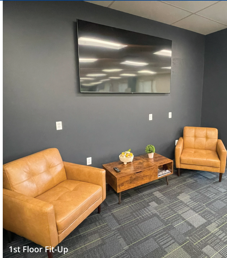
1st Floor Fit-Up