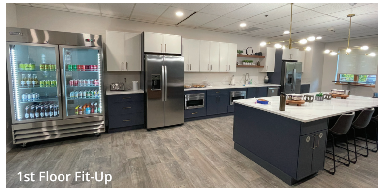
1st Floor Fit-Up