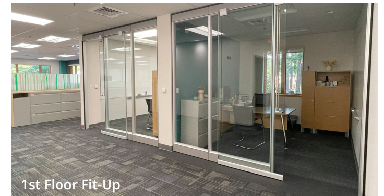
1st Floor Fit-Up