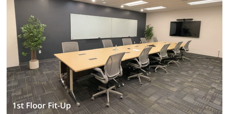
1st Floor Fit-Up