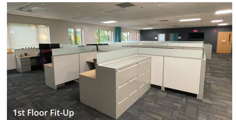
1st Floor Fit-Up