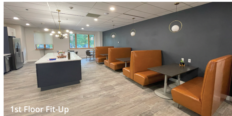
1st Floor Fit-Up