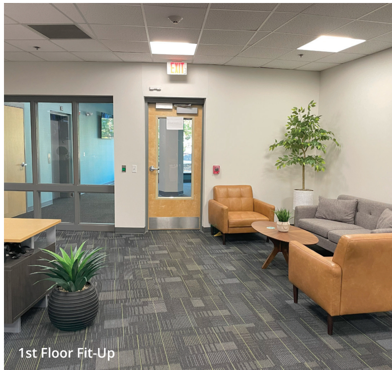
1st Floor Fit-Up