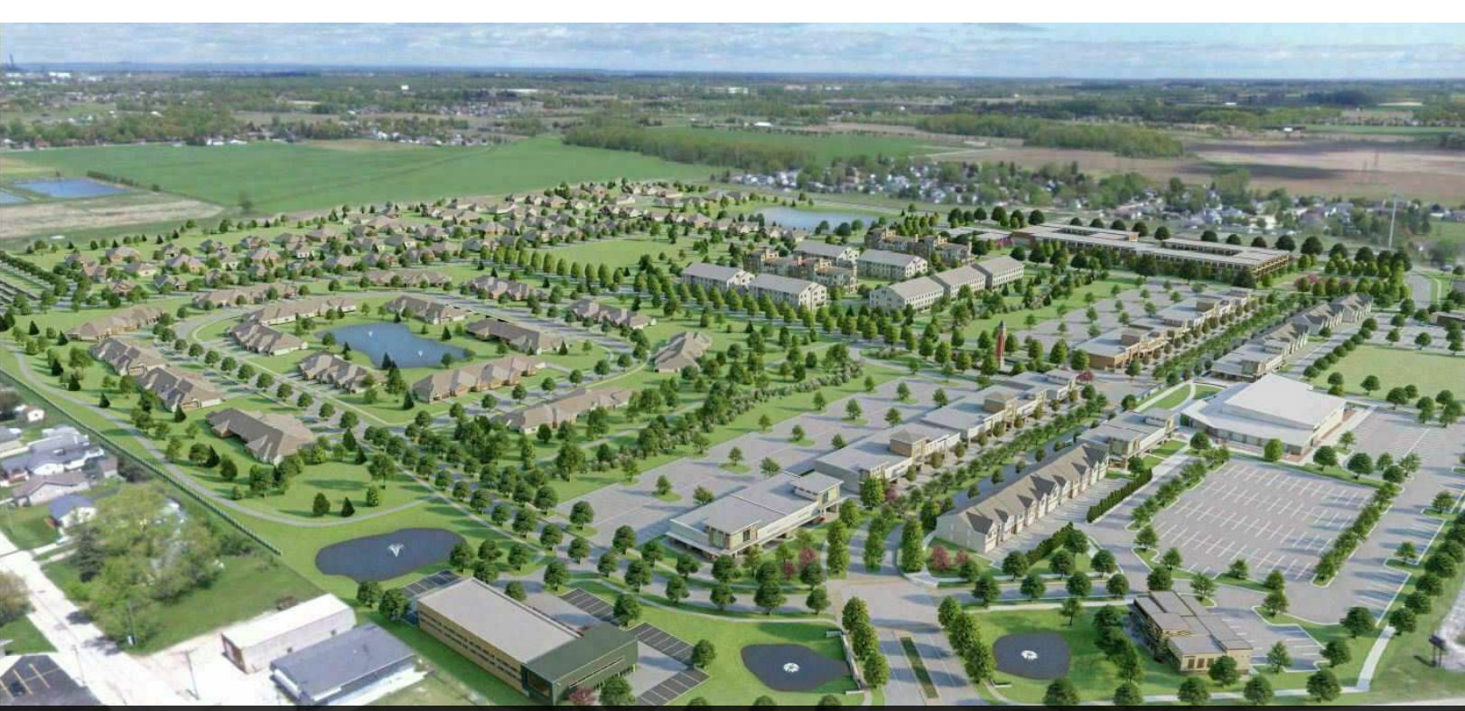
'The Enclave' - Mixed-Use Development Under Construction