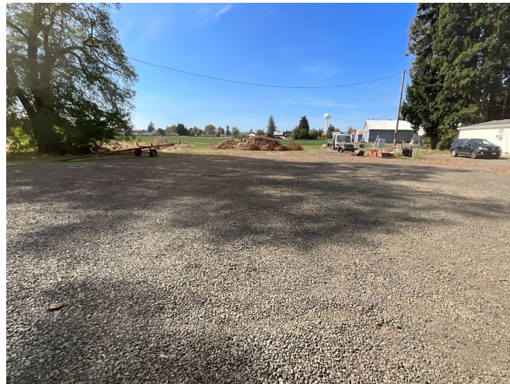
Yard Space (Will define boundaries when on-site)