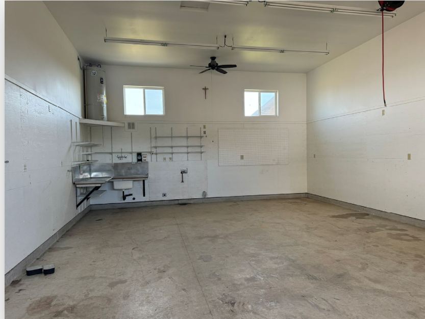
Shop with sink & air compressor hook up