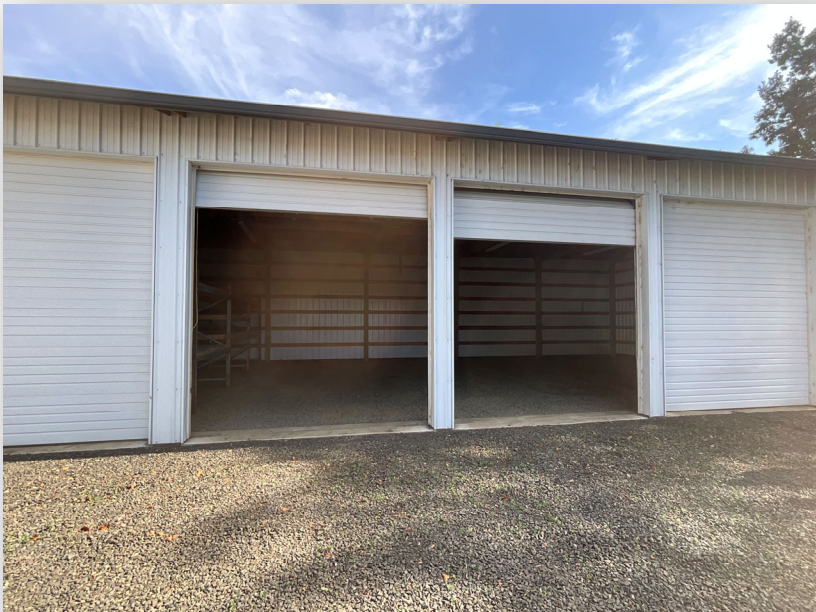
5 bays with gravel flooring