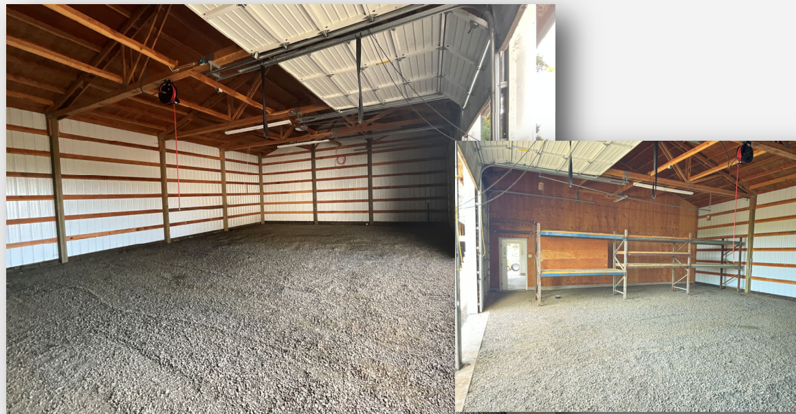
Inside view of 5 bays