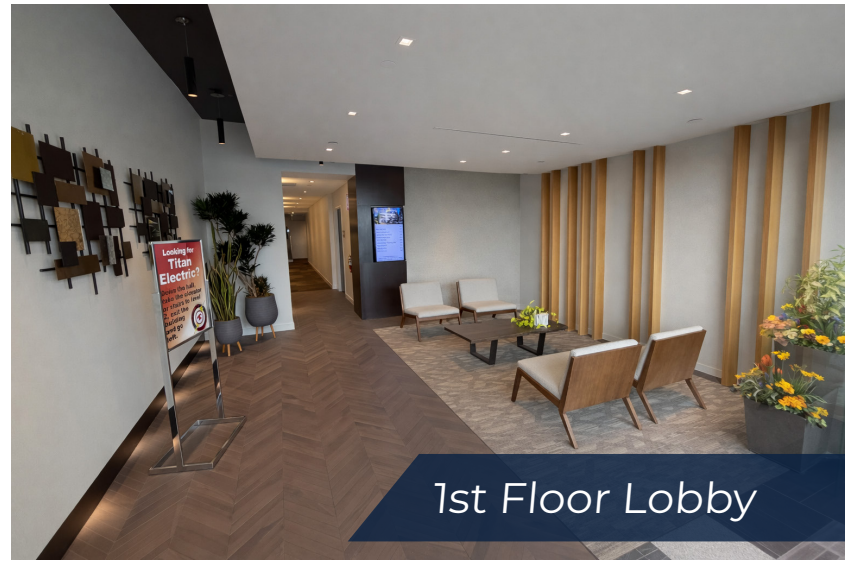
1st Floor Lobby

Base Rent $2,282.00/mo NNN Rent $903.29/mo Available July 1, 2026