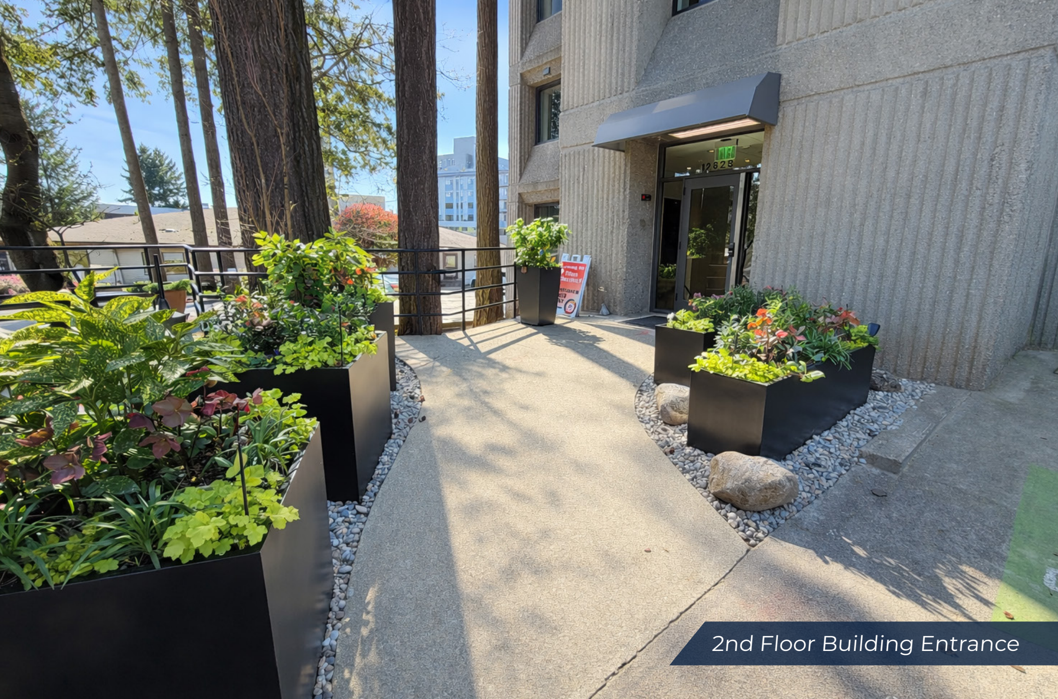
2nd Floor Building Entrance