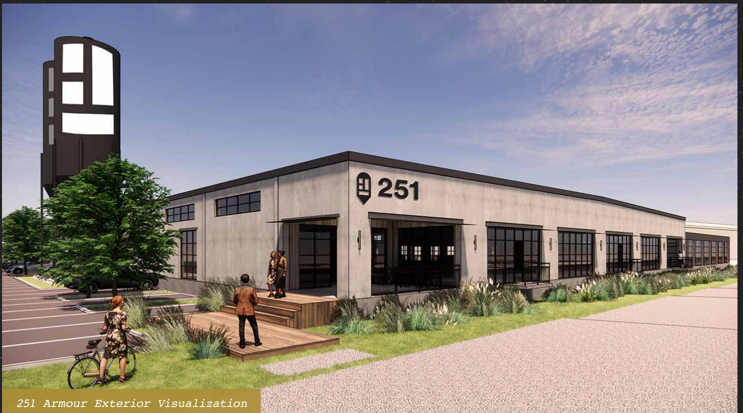
251 Armour Exterior Visualization