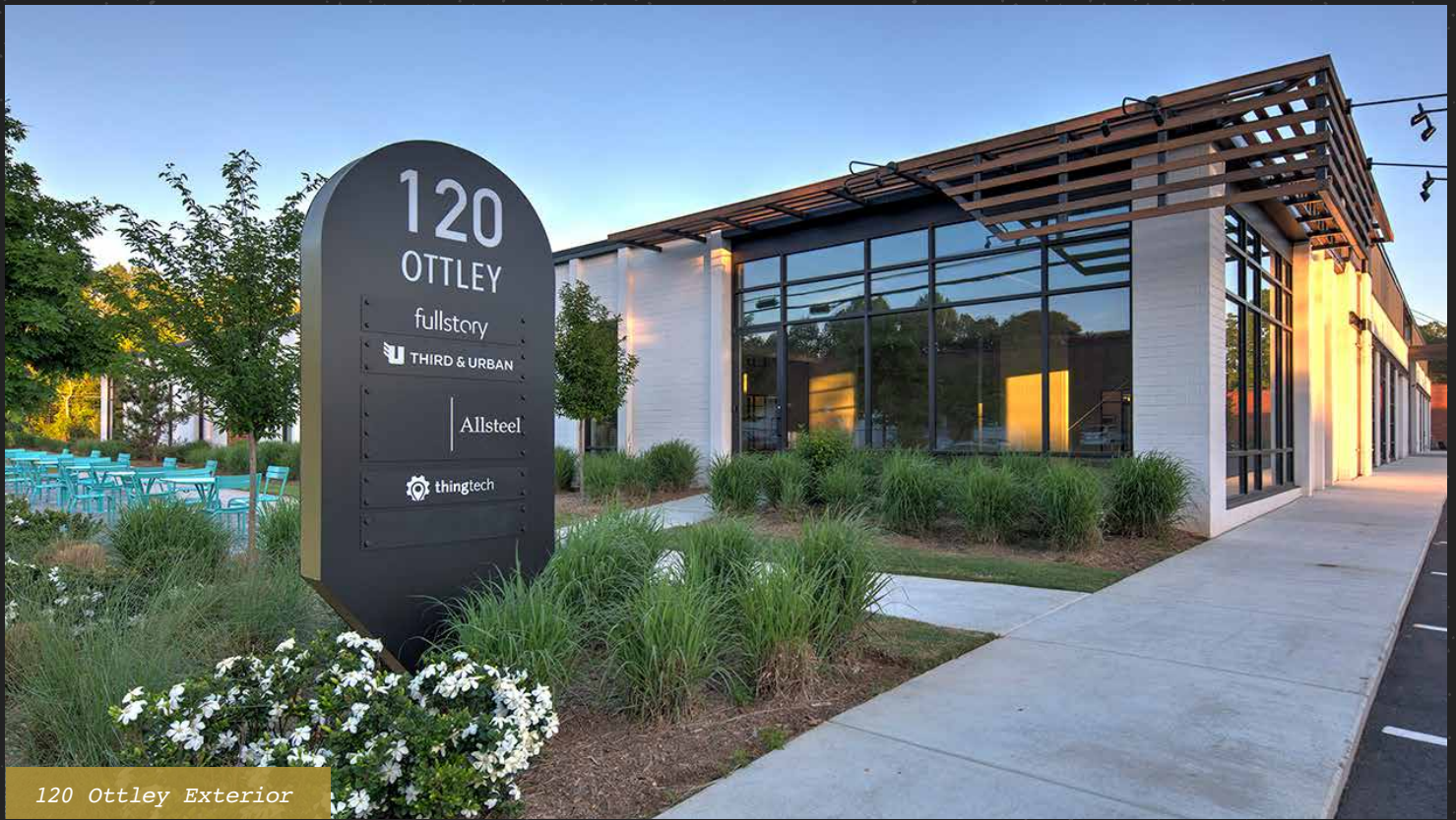
120 Ottley Exterior