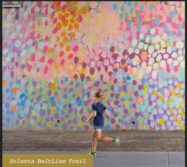
Atlanta BeltLine Trail