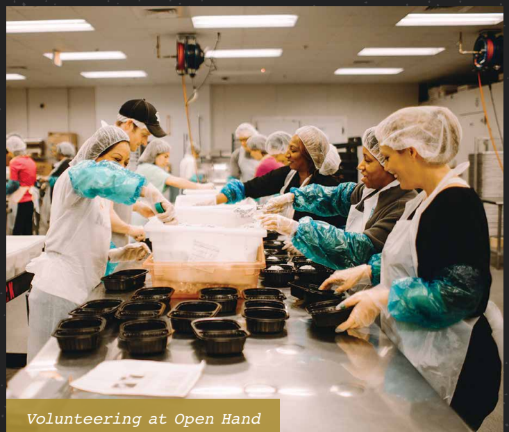
Volunteering at Open Hand