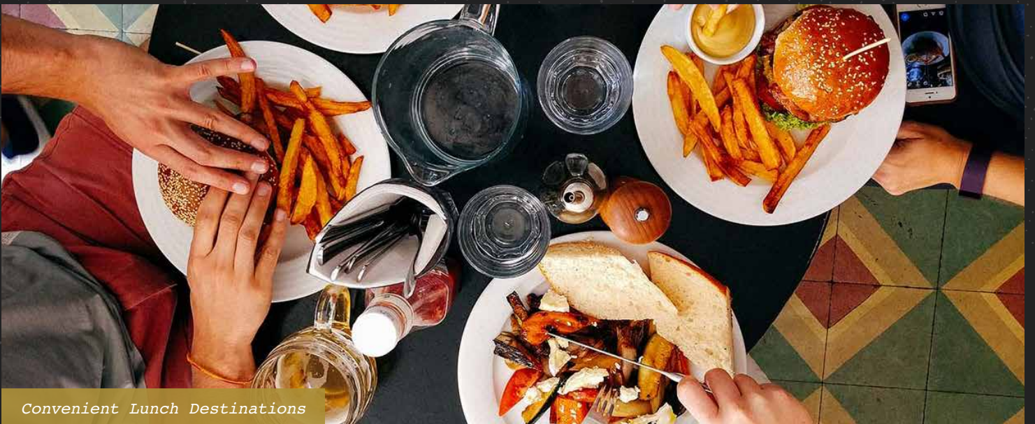
Convenient Lunch Destinations