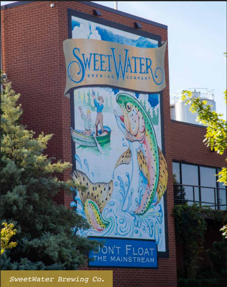
SweetWater Brewing Co.