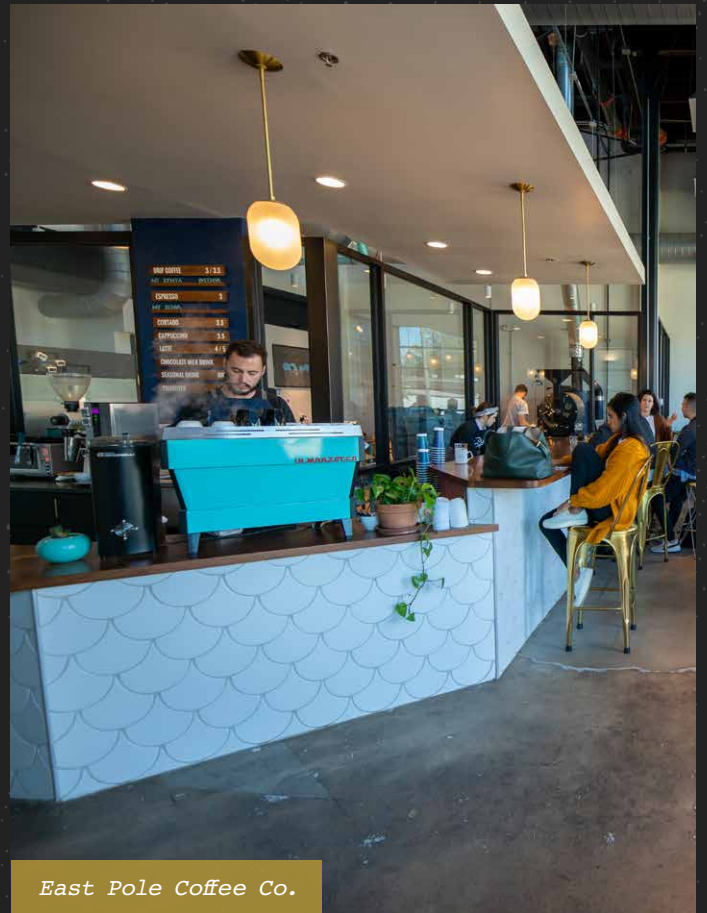
East Pole Coffee Co.