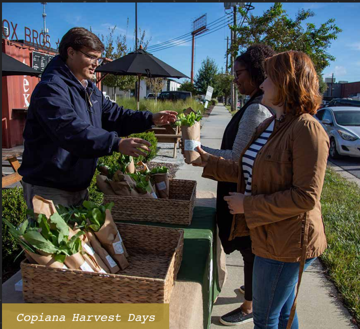
Copiana Harvest Days