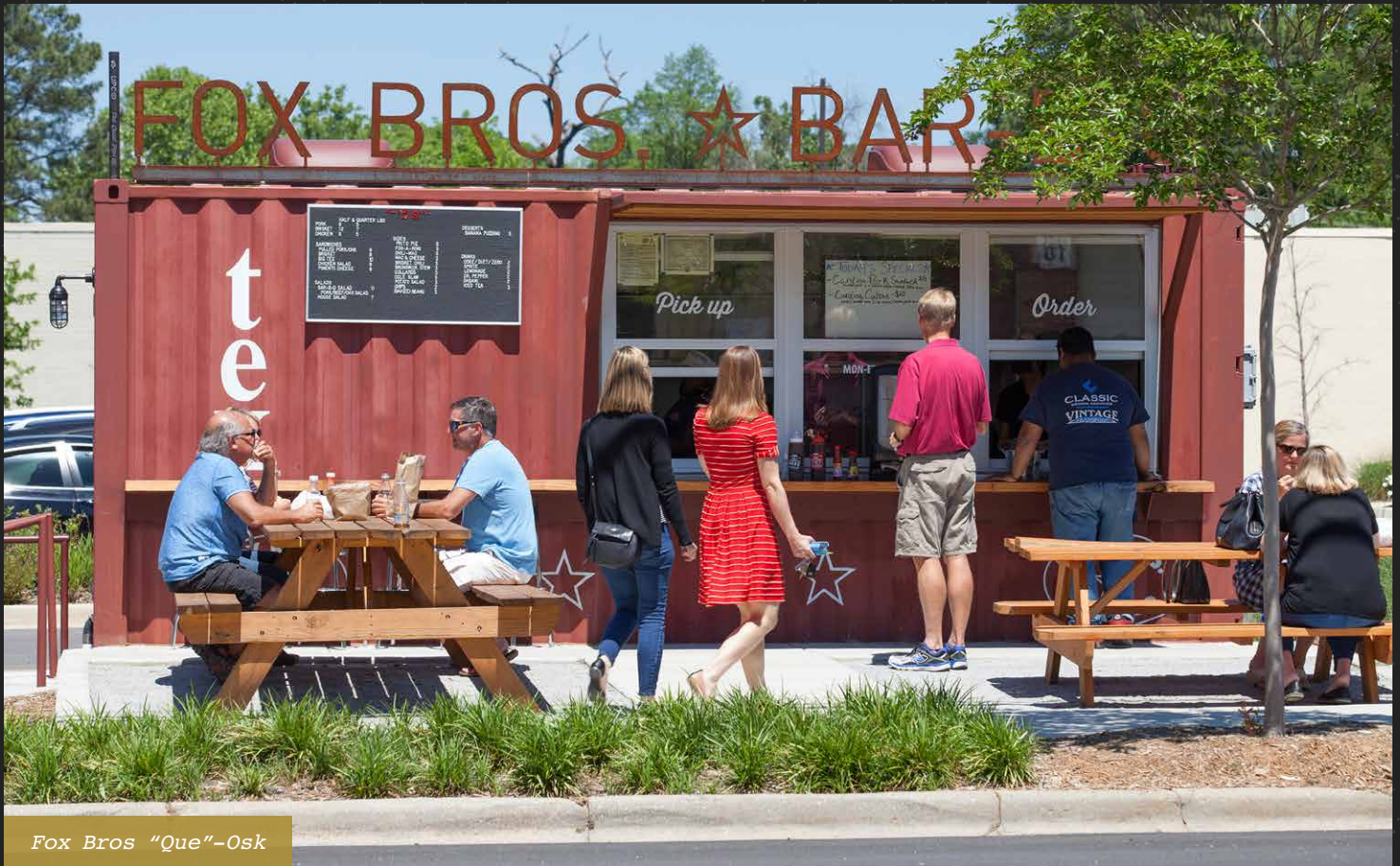
Fox Bros "Que"—Osk