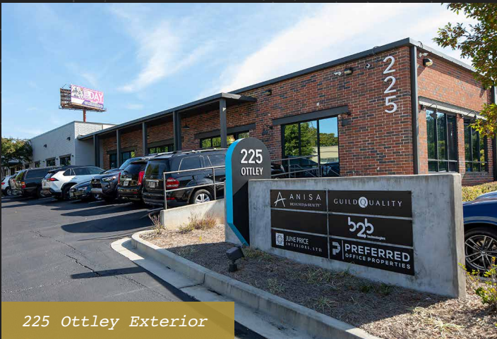
225 Ottley Exterior