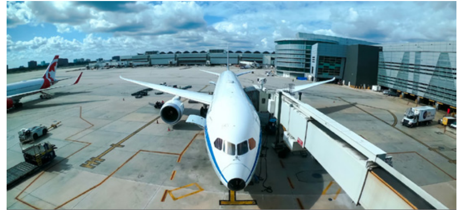
Subject Property +/-12 Miles from Miami International Airport