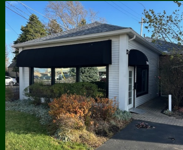
7540 Mentor Ave., Mentor, OH 44060