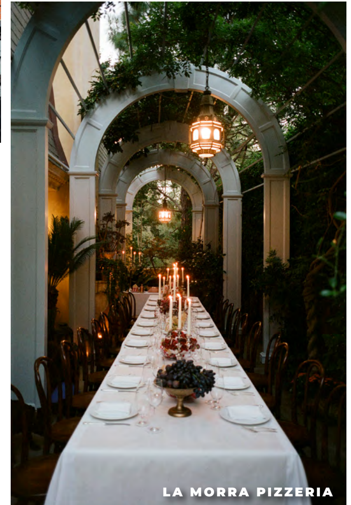
LA MORRA PIZZERIA