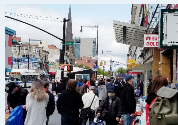
View of Sidewalk Foot Traffic in Front of Building