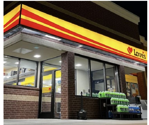
2 miles from Love's Travel Stop