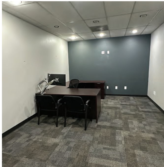
Large Executive Offices