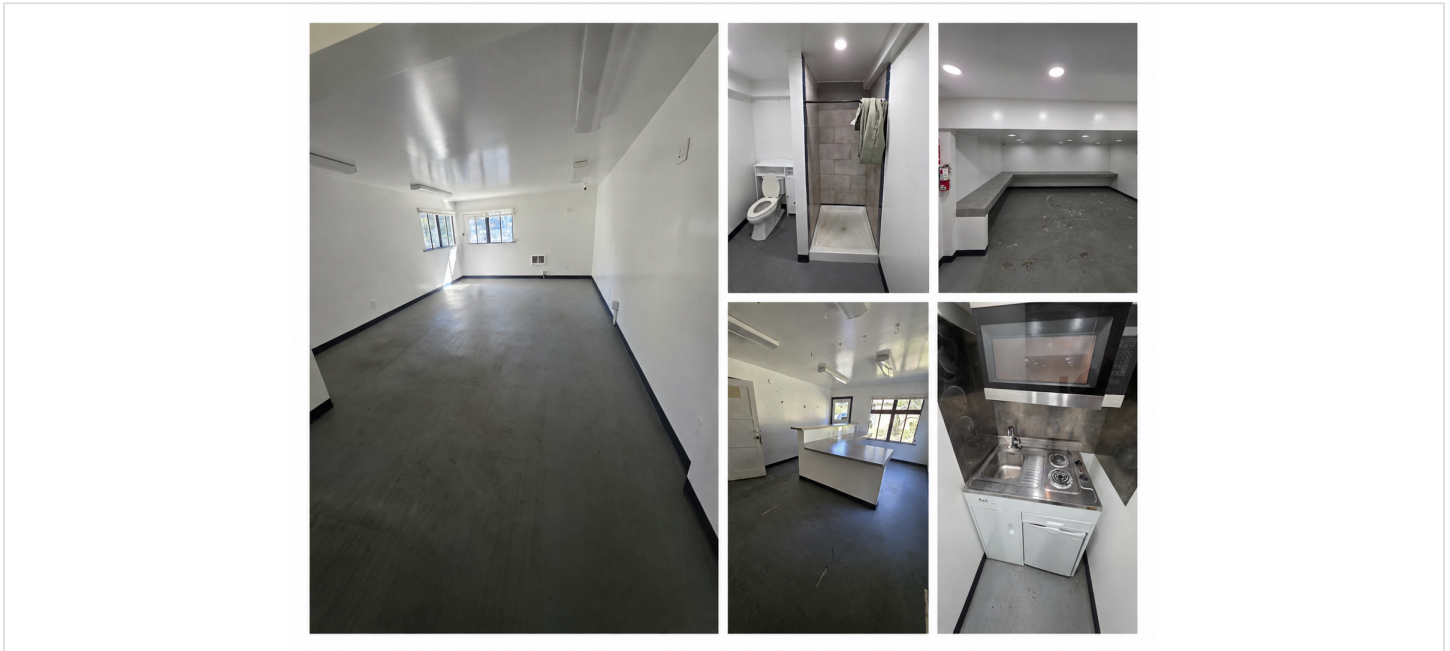
Office / Crew / Kitchenette / Bath

Shop, yard, office and optional residential component