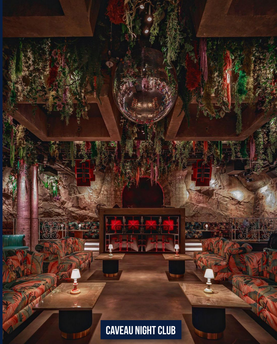
CAVEAU NIGHT CLUB