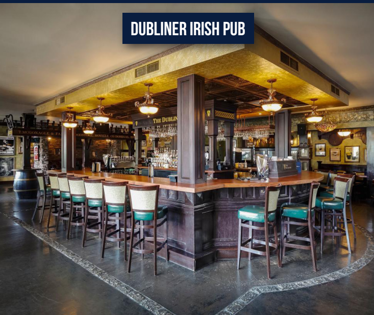
DUBLINER IRISH PUB