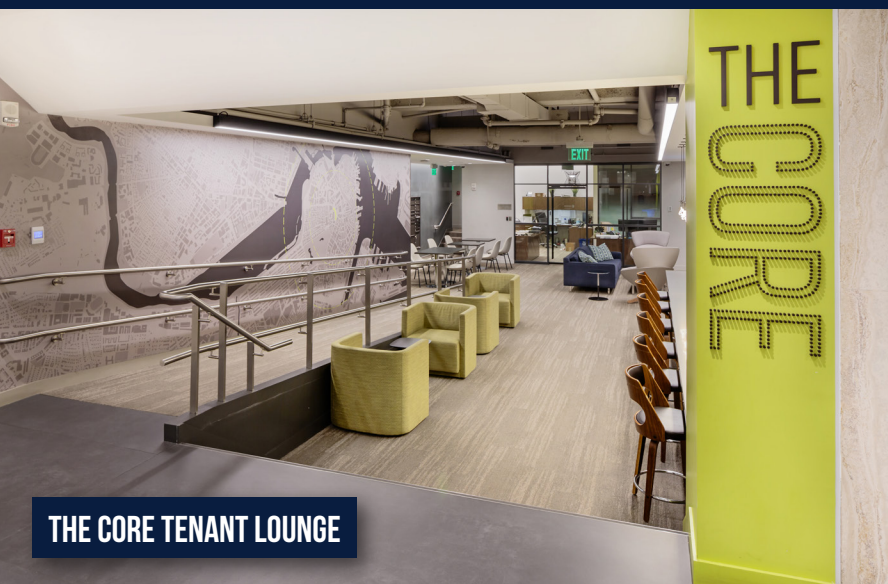
THE CORE TENANT LOUNGE