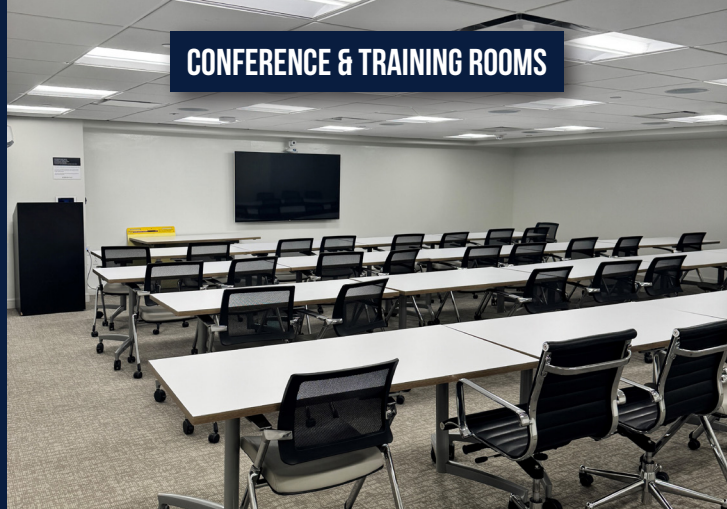
CONFERENCE & TRAINING ROOMS