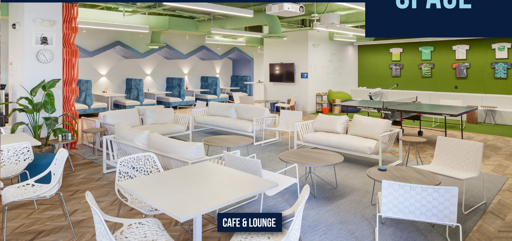
CAFE & LOUNGE