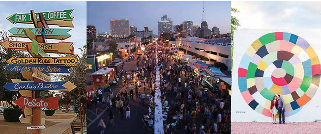
Roosevelt Row - 1.7 miles