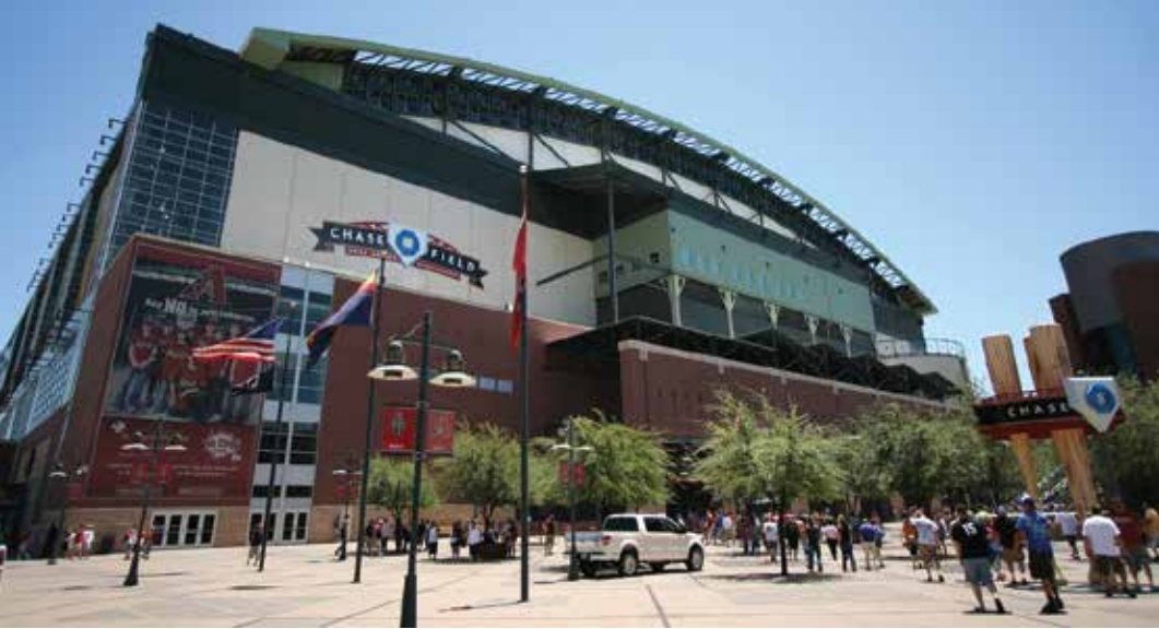
Chase Field - 0.6 miles