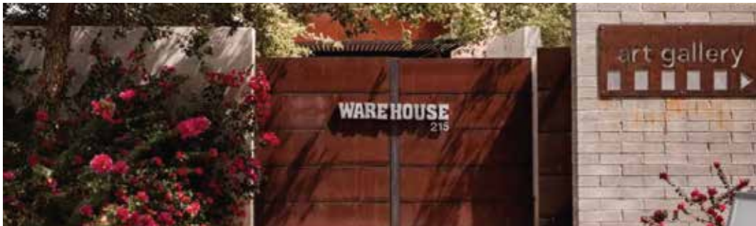
Warehouse 215 - 0.34 miles