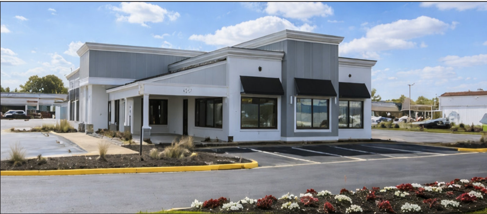
Heartland Dental | 1225 Cedar Road, Chesapeake, VA 23322