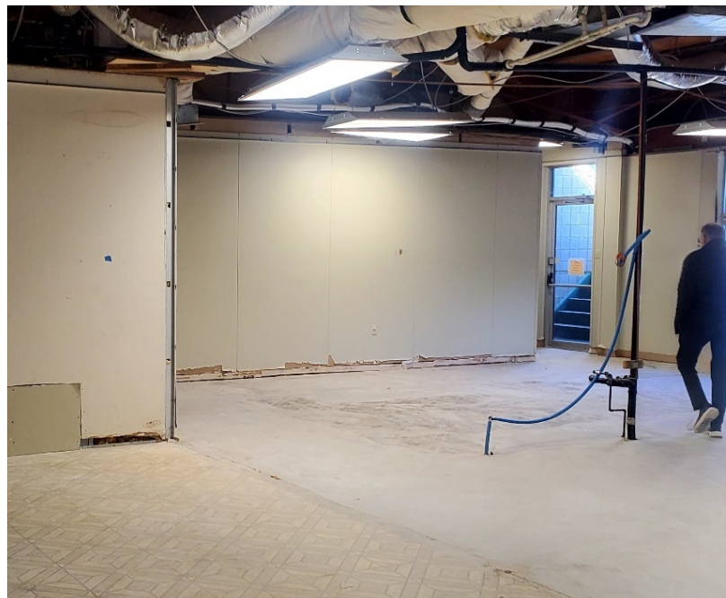
Suite 218 - Unfinished space

Information is deemed reliable but is not guaranteed. Agency Disclosure: RPM Group is the agent for the owner of the property described herein.