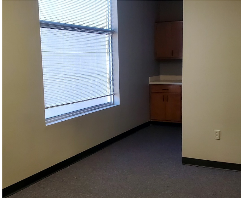
Suite 209 - Large office with built-ins