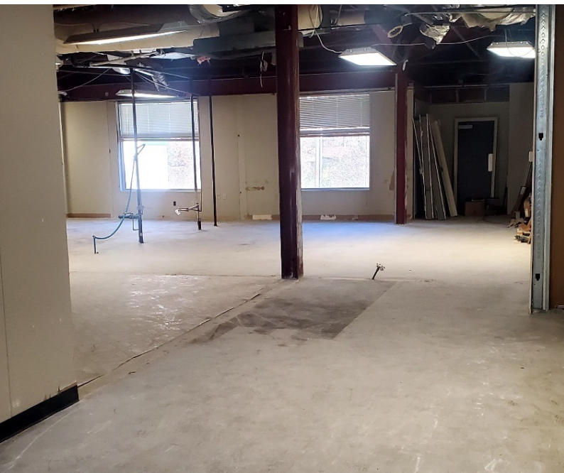
Suite 218 - Unfinished space