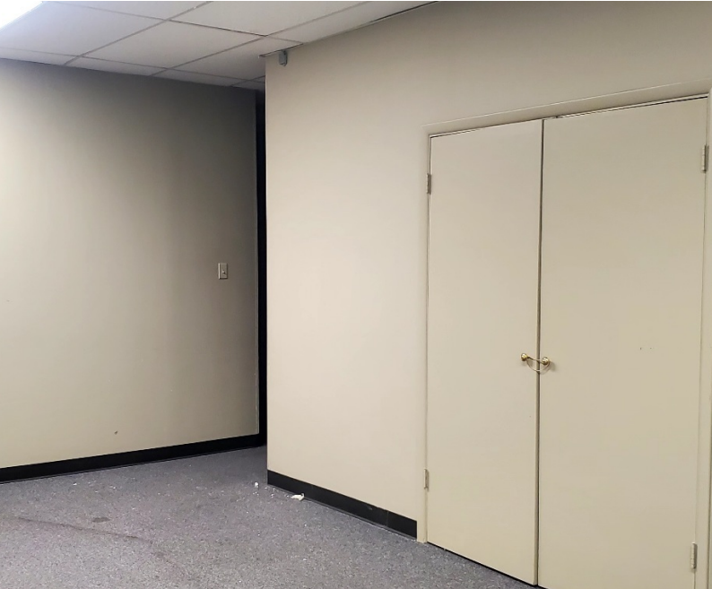
Suite 209 - Large entrance/reception area