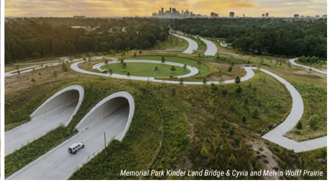
Memorial Park Kinder Land Bridge & Cyvia and Melvin Wolff Prairie

Quality of Life: The metropolitan area's favorable location and climate translate to an abundance of outdoor activities. More than a dozen state parks and recreation areas lie within a short drive of Houston's city limits, as well as more than 500 local parks and open spaces, various cultural venues and museums.