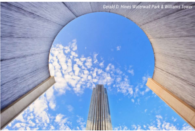
Gerald D. Hines Waterwall Park & Williams Tower

The metropolitan area is also known internationally for its medical community and is home to Texas Medical Center , the largest of its kind in the world.