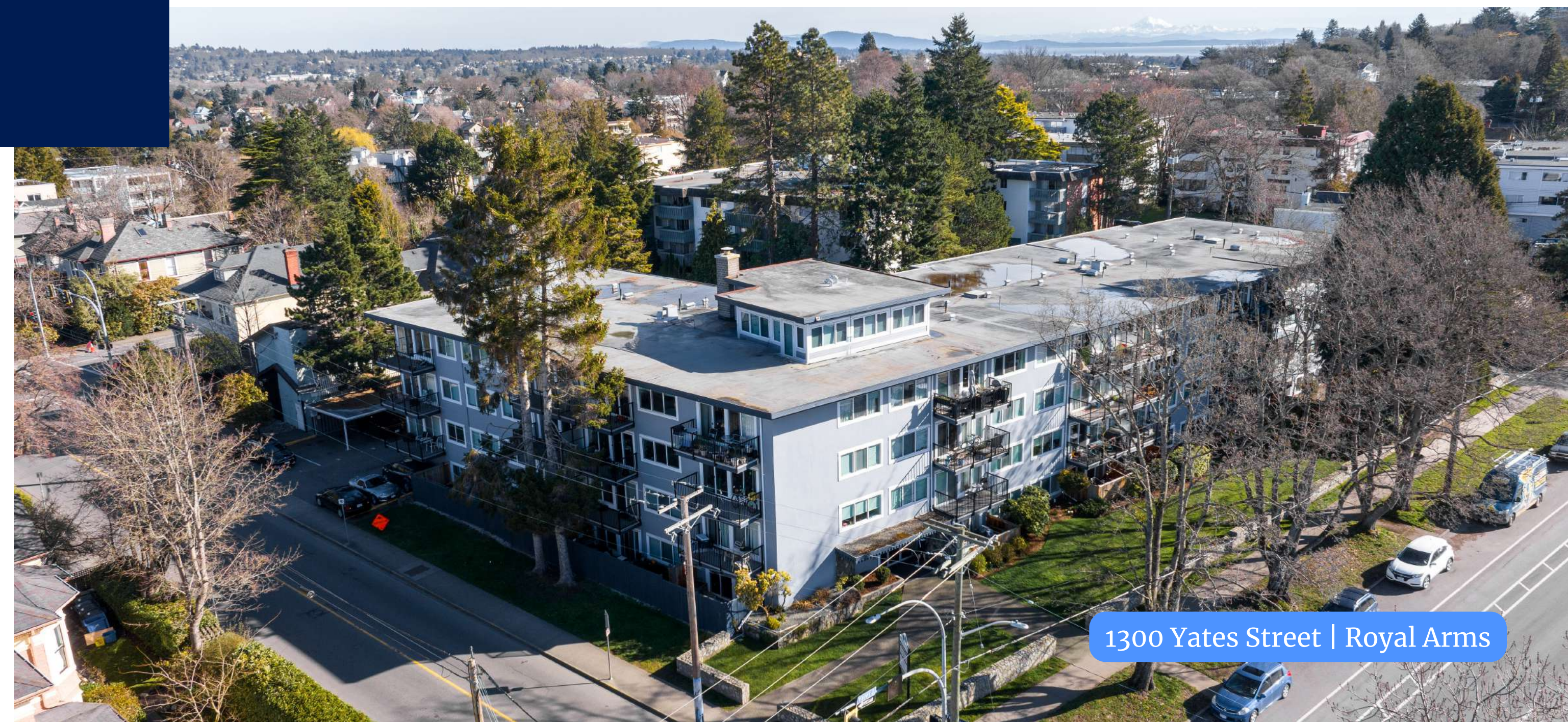
1300 Yates Street | Royal Arms