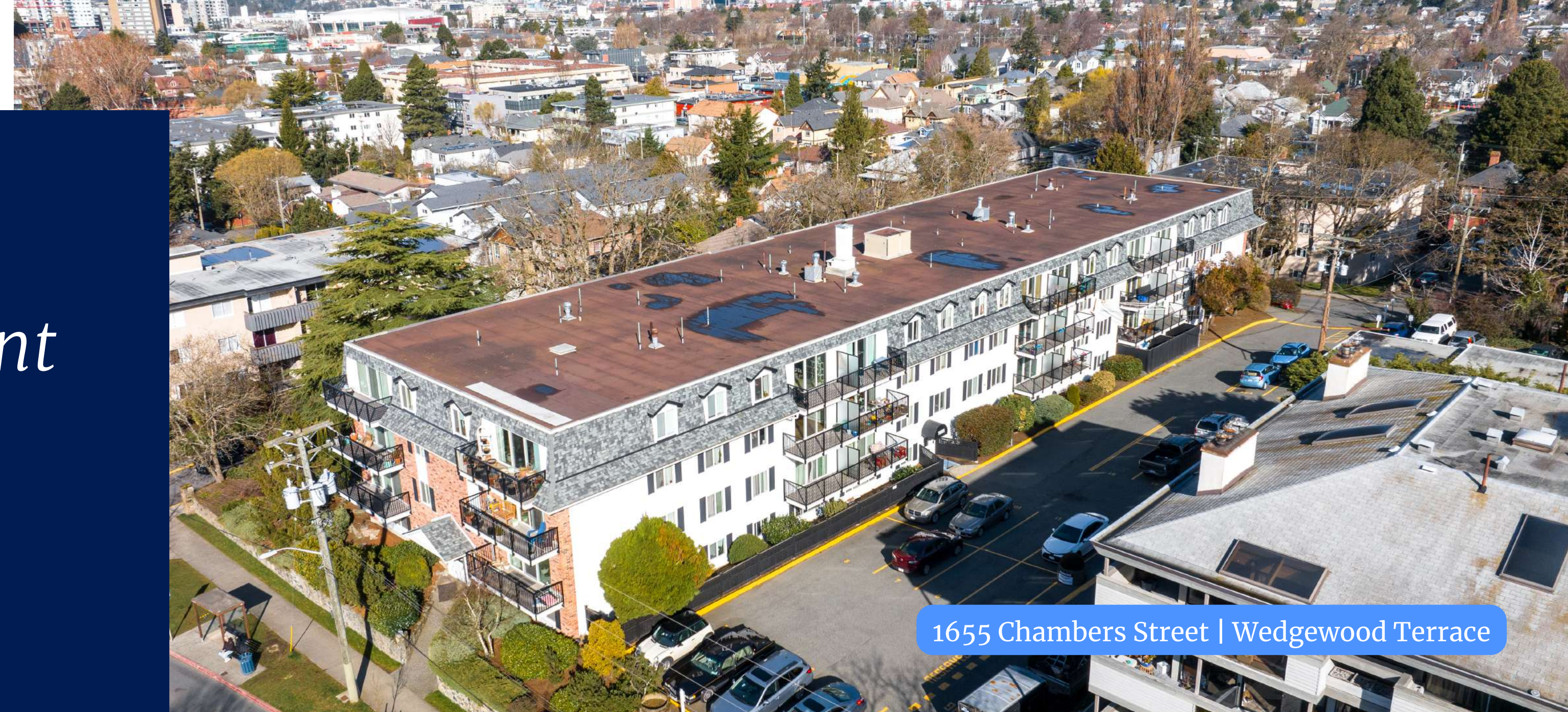
1655 Chambers Street | Wedgewood Terrace