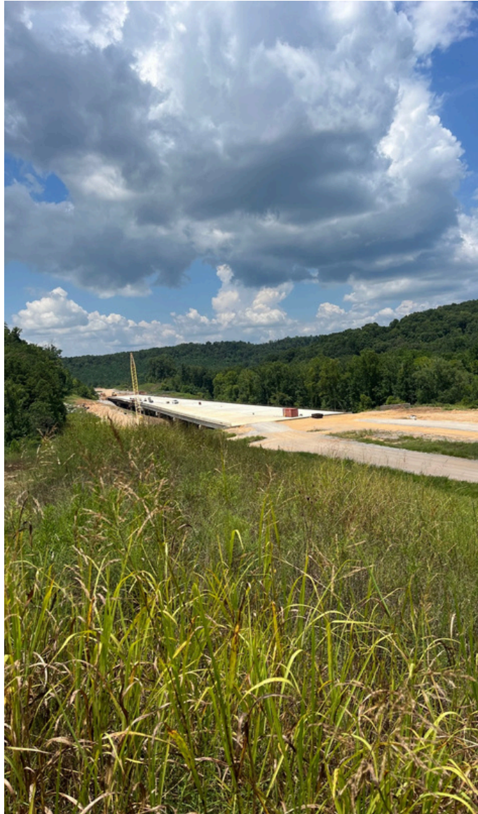
Beltline View West