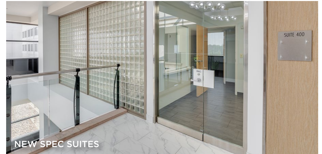
NEW SPEC SUITES