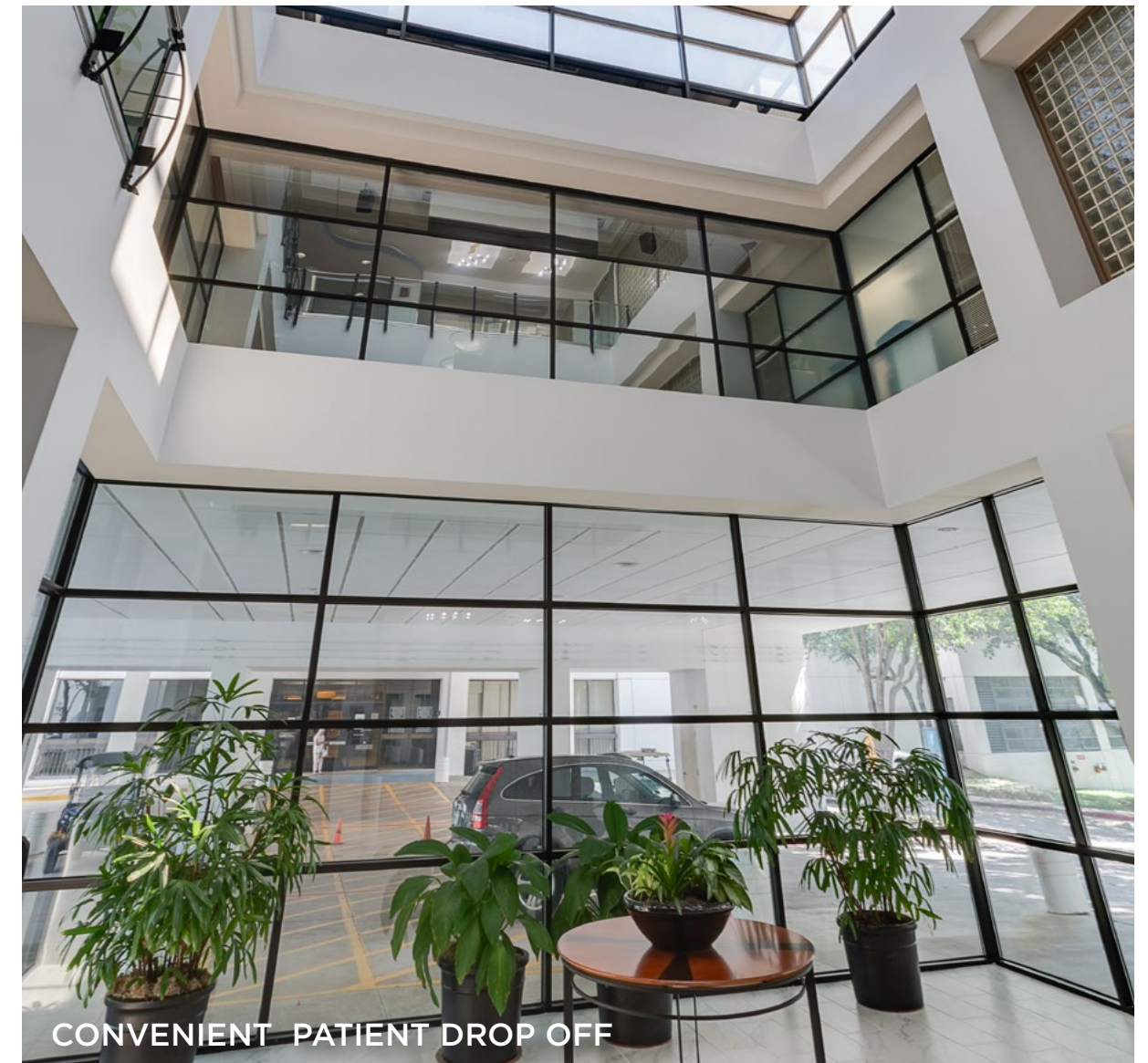
CONVENIENT PATIENT DROP OFF