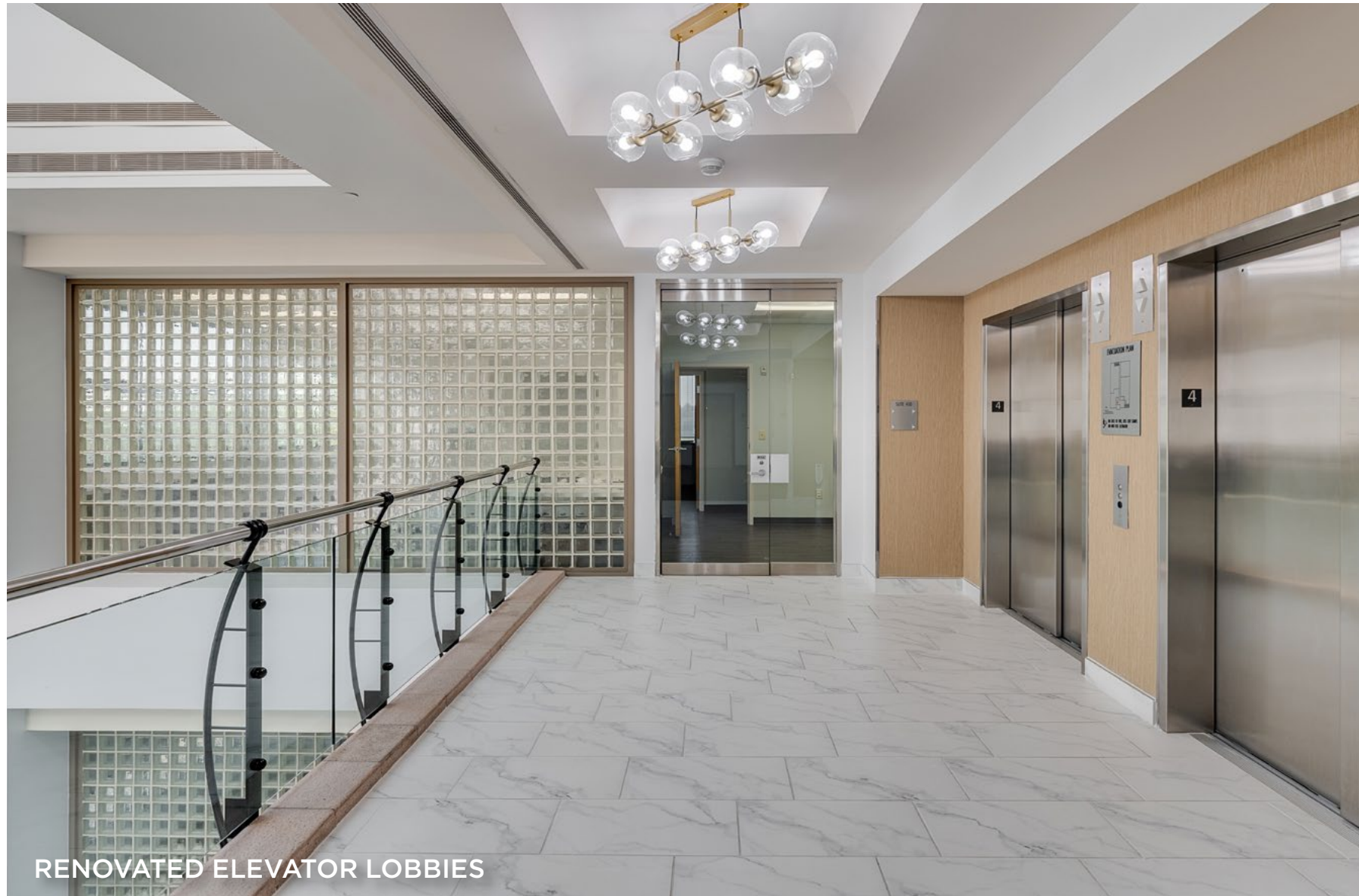
RENOVATED ELEVATOR LOBBIES