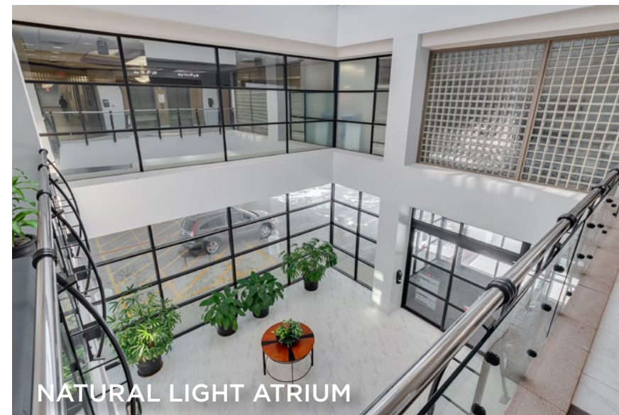
NATURAL LIGHT ATRIUM