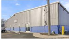
29800 N. SKOKIE HWY