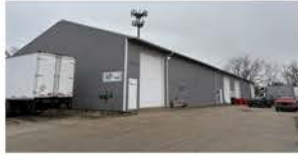
29820-29830 N. SKOKIE HWY