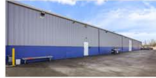
29850 N. SKOKIE HWY