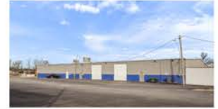
29860 N. SKOKIE HWY