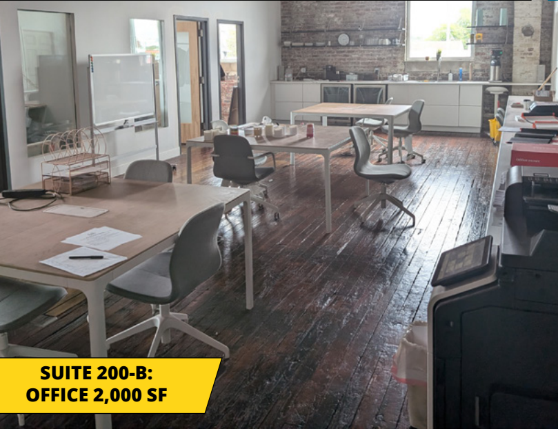
SUITE 200-B: OFFICE 2,000 SF

208 W. 25th Street NORFOLK RAILROAD DISTRICT