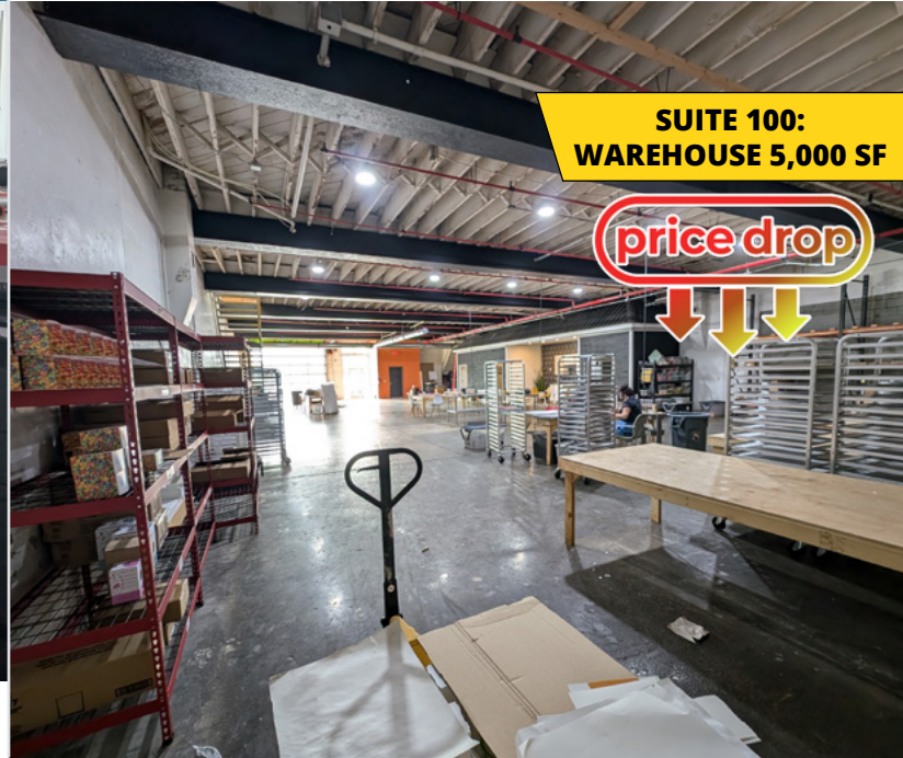
SUITE 100: WAREHOUSE 5,000 SF