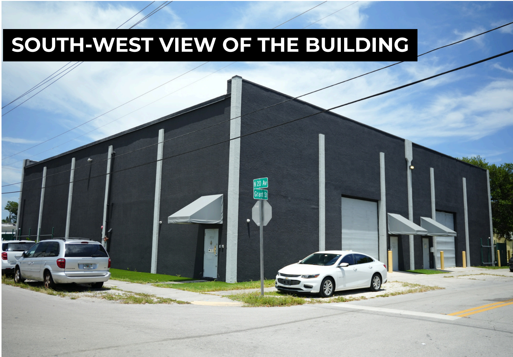
SOUTH-WEST VIEW OF THE BUILDING