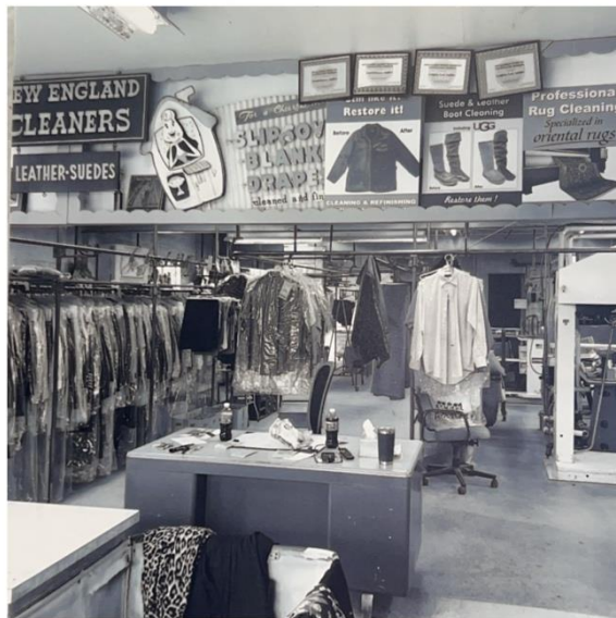
PhotoScan by Google Photos