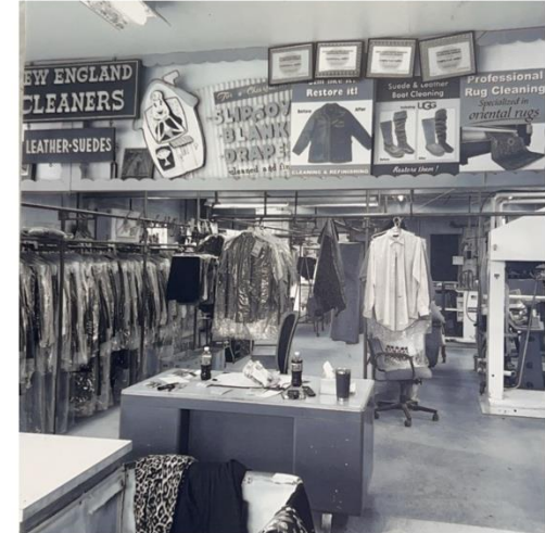
PhotoScan by Google Photos