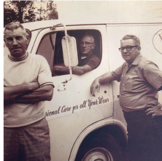
PhotoScan by Google Photos