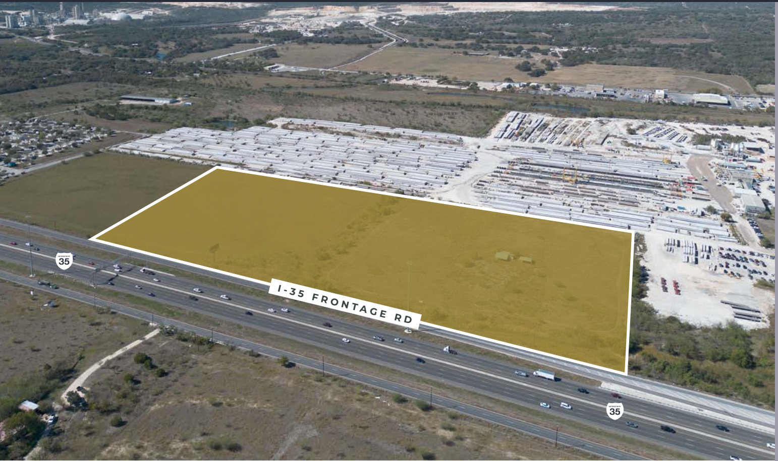
AERIAL VIEW FACING WEST