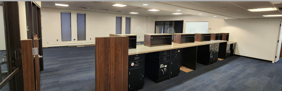
Interior facing front door