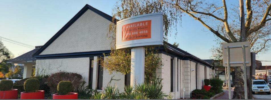
View from Middle Neck Rd