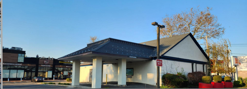
View from Parking Lot