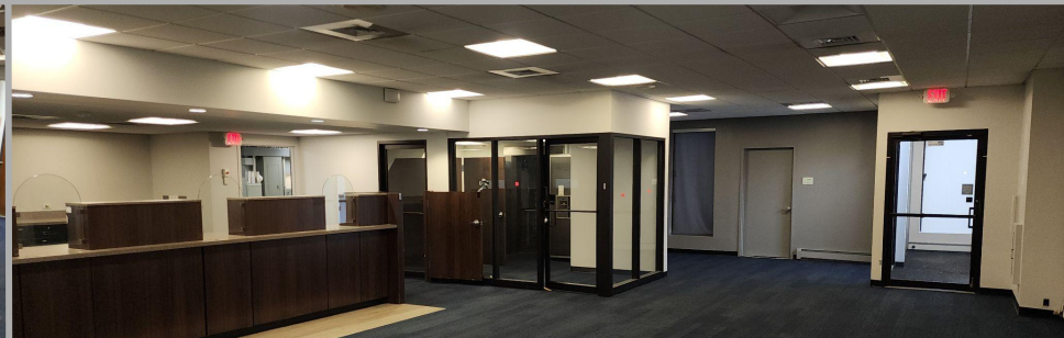
Interior facing east

540 Middle Neck Road - Great Neck, NY 2,810 Square Feet