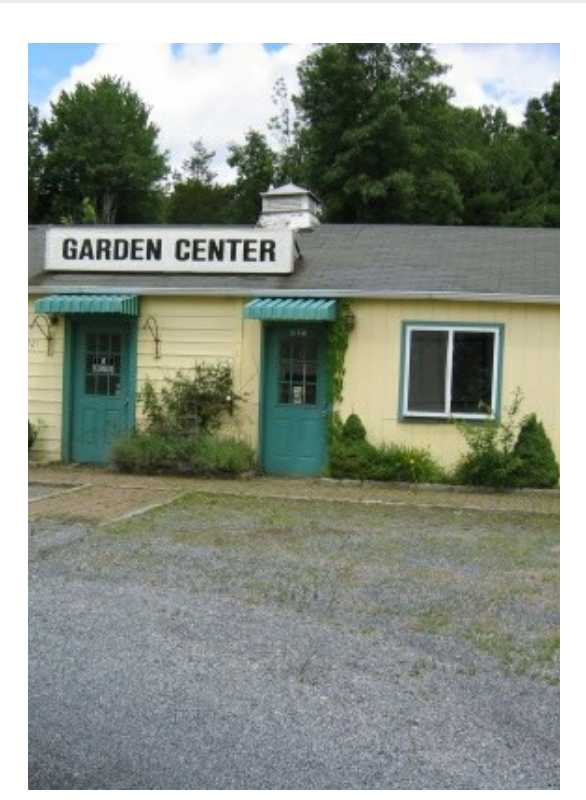
1921 Route 44 1921 Route 44, Pleasant Valley, NY 12569