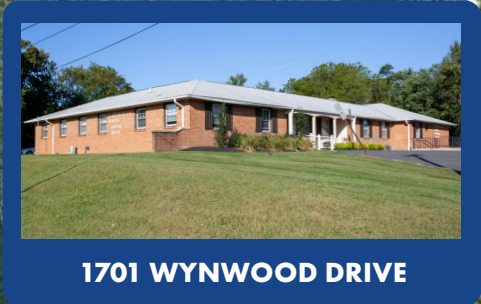
1701 WYNWOOD DRIVE