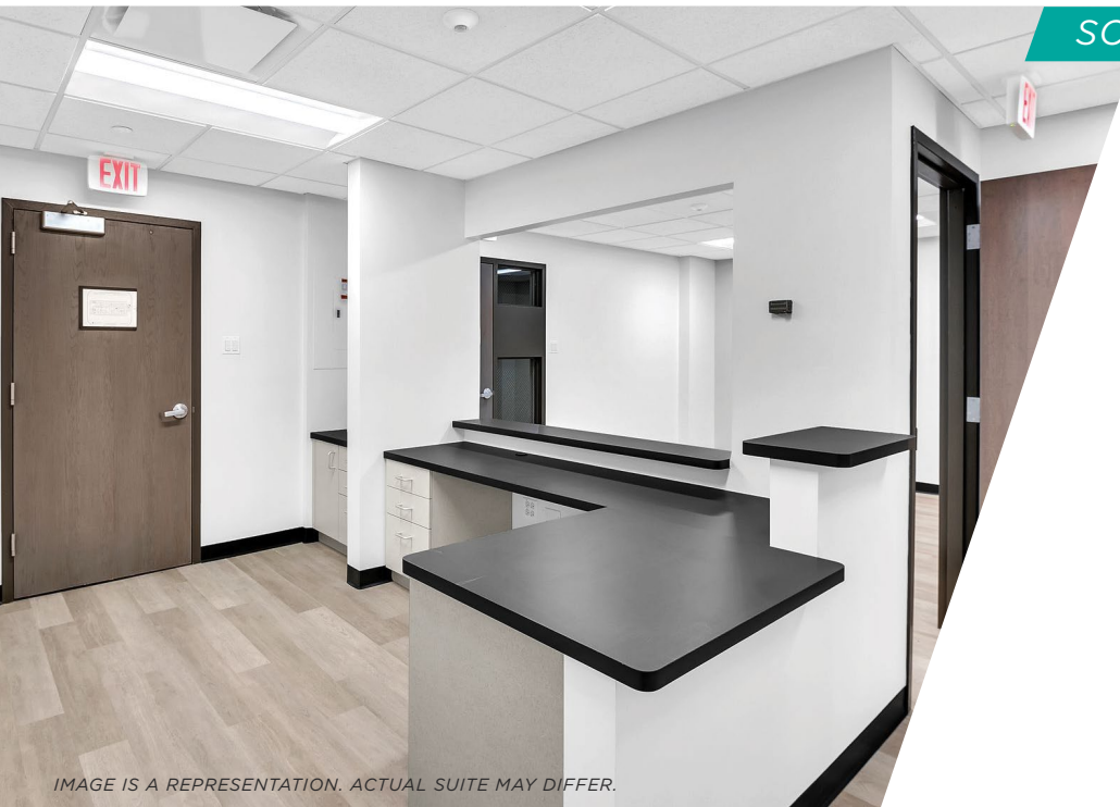
IMAGE IS A REPRESENTATION. ACTUAL SUITE MAY DIFFER.

Our SPEC suites combine convenience and quality in one perfect package. With sleek, modern finishes already in place, these suites are designed to be fully operational as soon as you move in. Skip the hassle and delays of construction and permitting —just move in and start seeing patients!