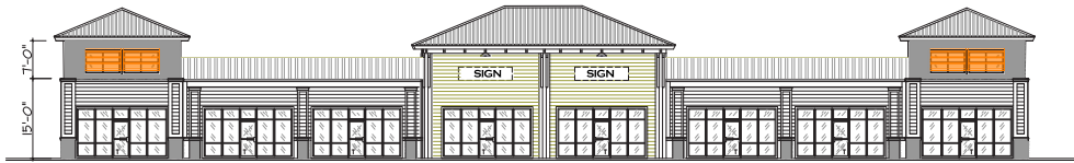
2 EAST ELEVATION SCALE: N.T.S.

The information contained herein has been given to us by the owner of the property or other sources we deem reliable. We have no reason to doubt its accuracy, but we do not guarantee it. All information should be verified prior to leasing.