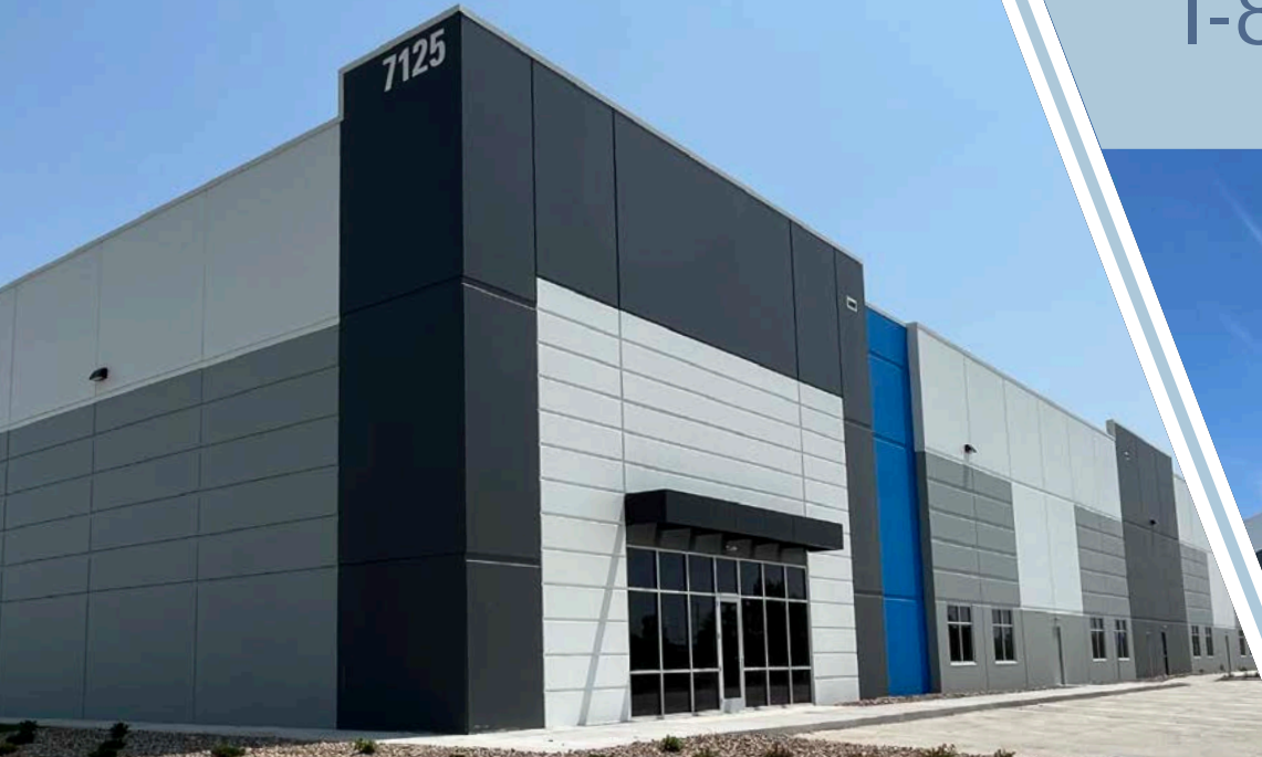
I-35 DISTRIBUTION CENTER 7055 - 7125 SE DELAWARE, ANKENY, IA

EXPERIENCE BRAND-NEW INDUSTRIAL WAREHOUSE SPACE, AVAILABLE FOR SALE OR LEASE NOW