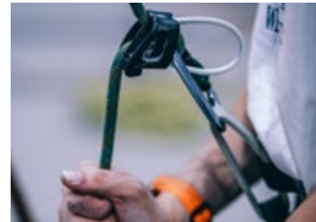
Ziplining, ropes courses and climbing tower