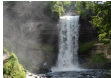
Paths that lead to walk under waterfalls