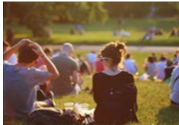
Festival field, terraced lawns and outdoor amphitheater