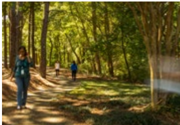
Over 6 miles of walking trails, bridges, and scenic landscaping