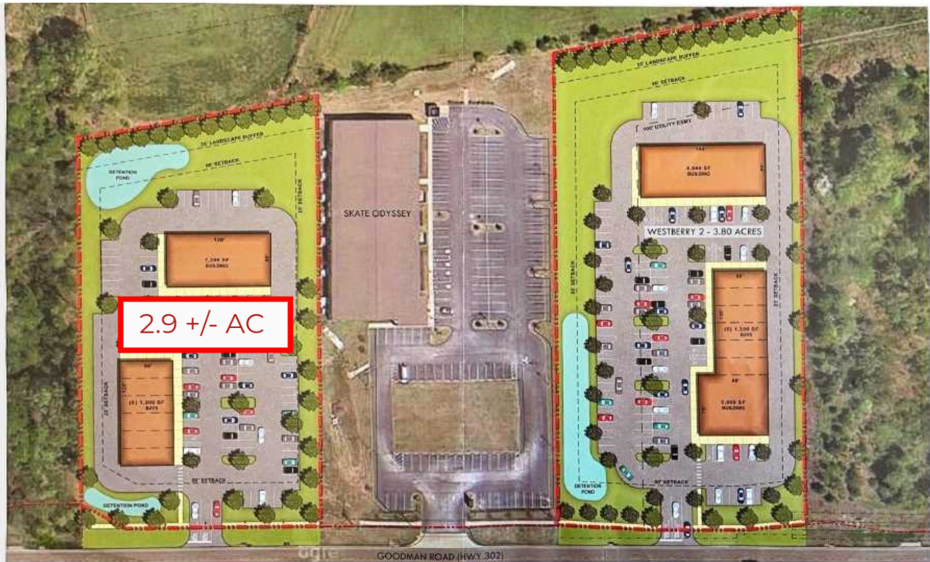
Westberry 3 - 4578 Goodman Rd W