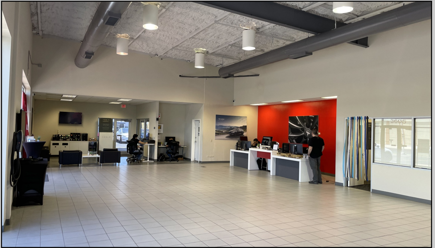
Tesla Office Area & Shop Area