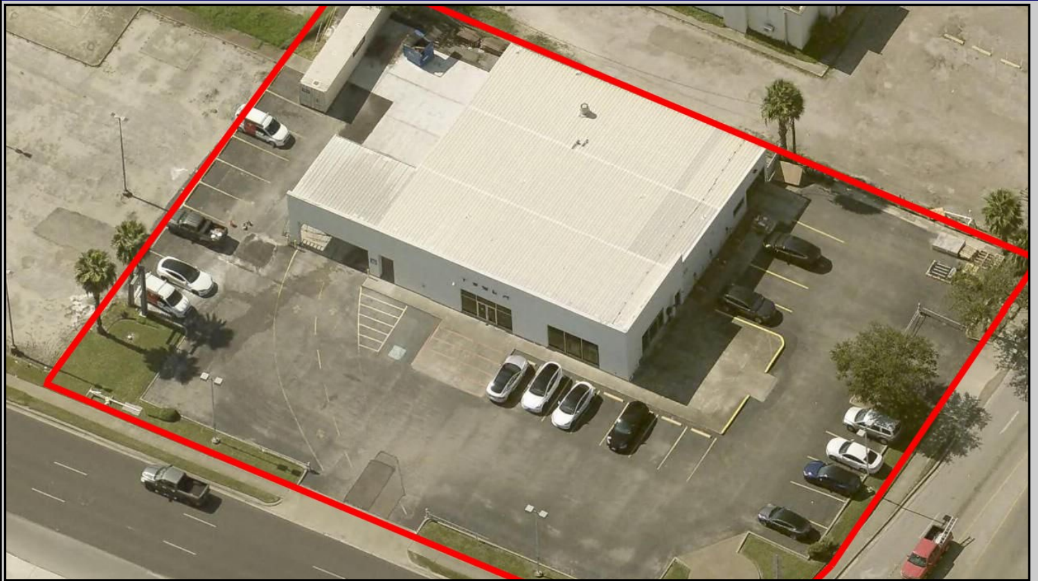
6,202 SF Building on South Padre Island Dr.