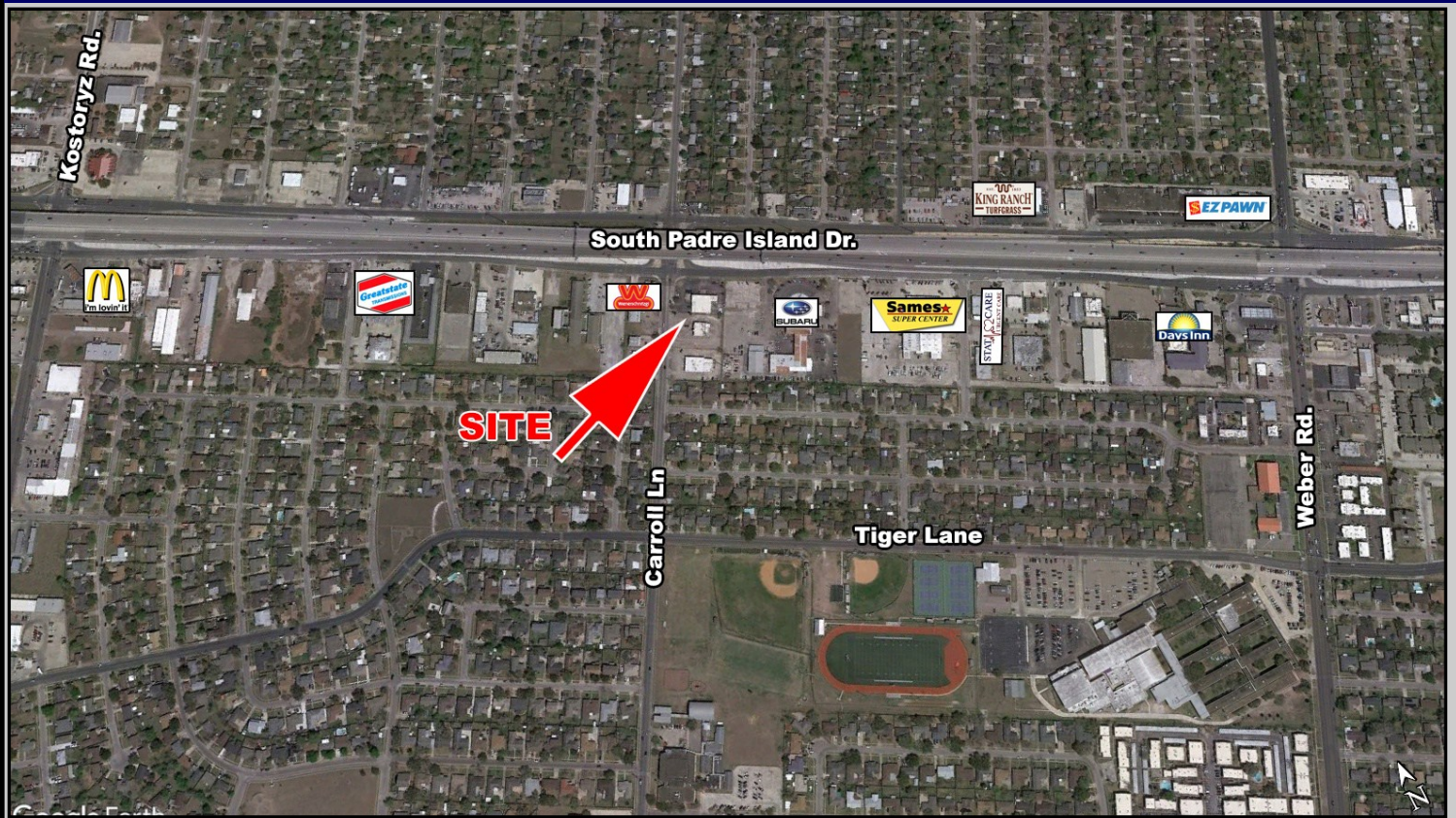
6,202 SF Building on South Padre Island Dr.