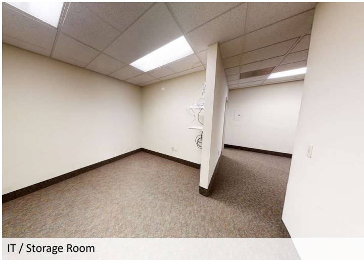
IT / Storage Room