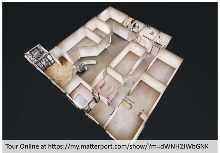
Tour Online at https://my.matterport.com/show/?m=dWNH2JWbGNK