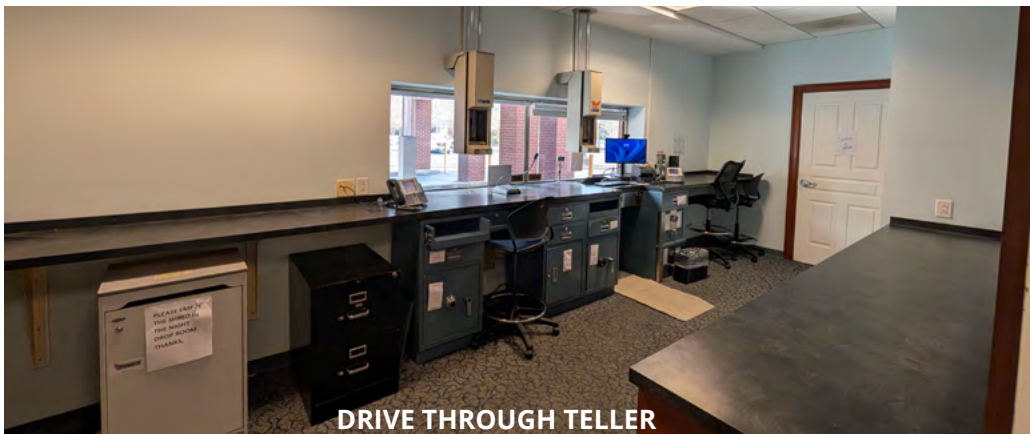
DRIVE THROUGH TELLER