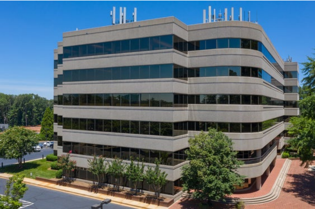
NEWLY RENOVATED LOBBY