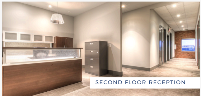
SECOND FLOOR RECEPTION

C: 403-200-9264 jclark@investplus properties.com