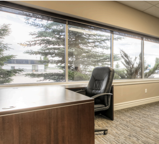
FIRST FLOOR OFFICE SPACE