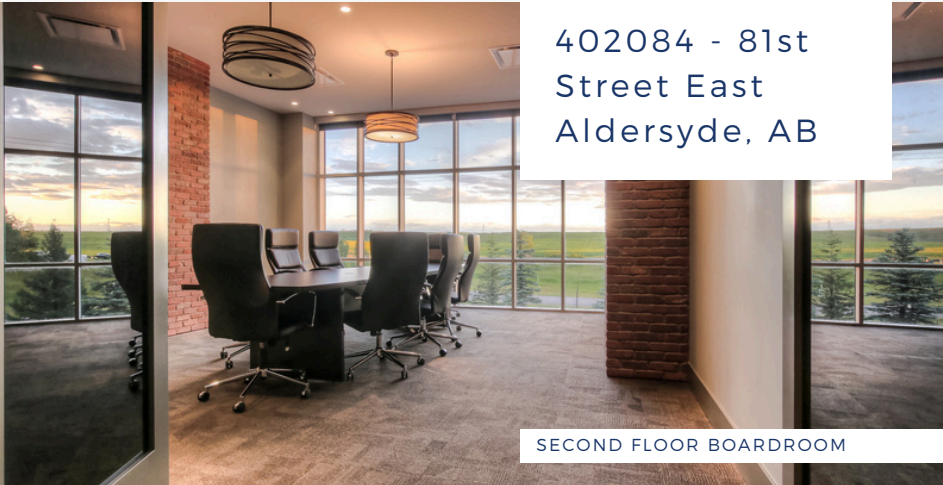
SECOND FLOOR BOARDROOM