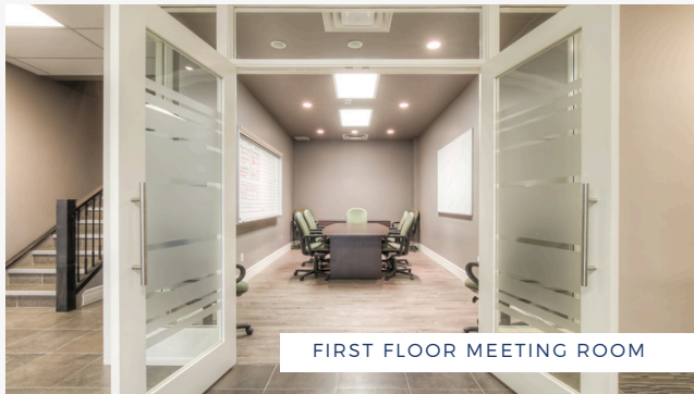
FIRST FLOOR MEETING ROOM

C: 403-200-9264 jclark@investplus properties.com