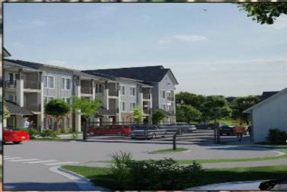
Kelly Hallow Apartments