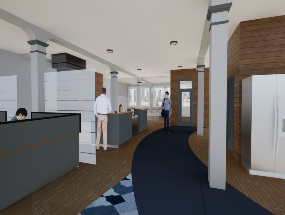
3rd Floor Rendering