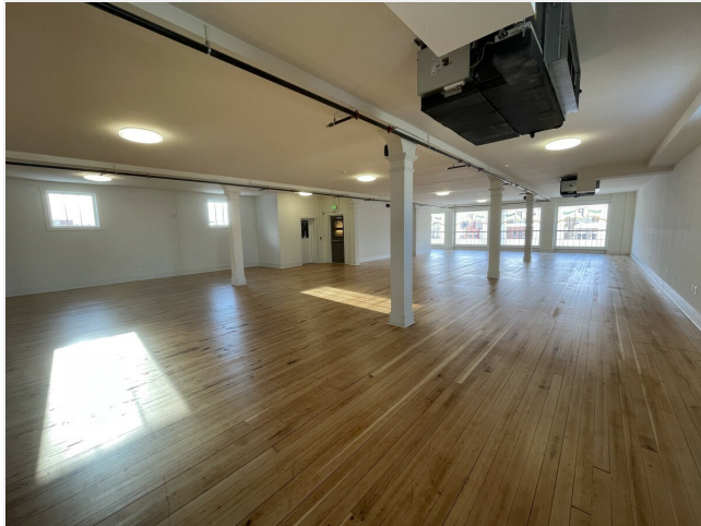
Purpose 4th Floor-1