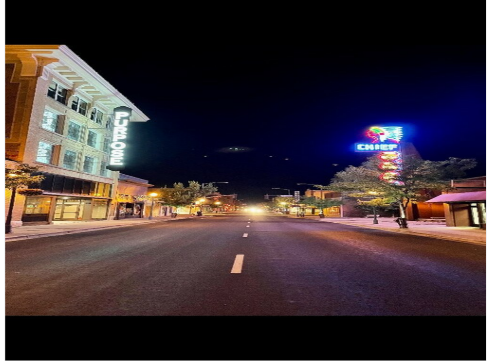
Night Neon Sign