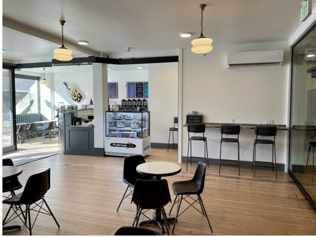
Boba Tea Shop