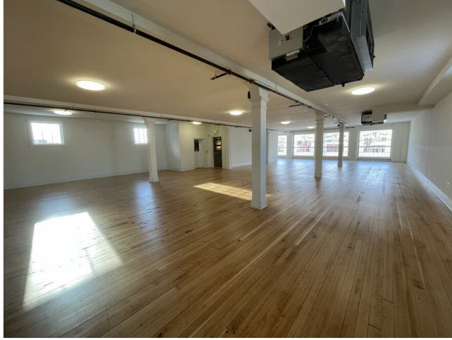
Purpose 3rd Floor-1