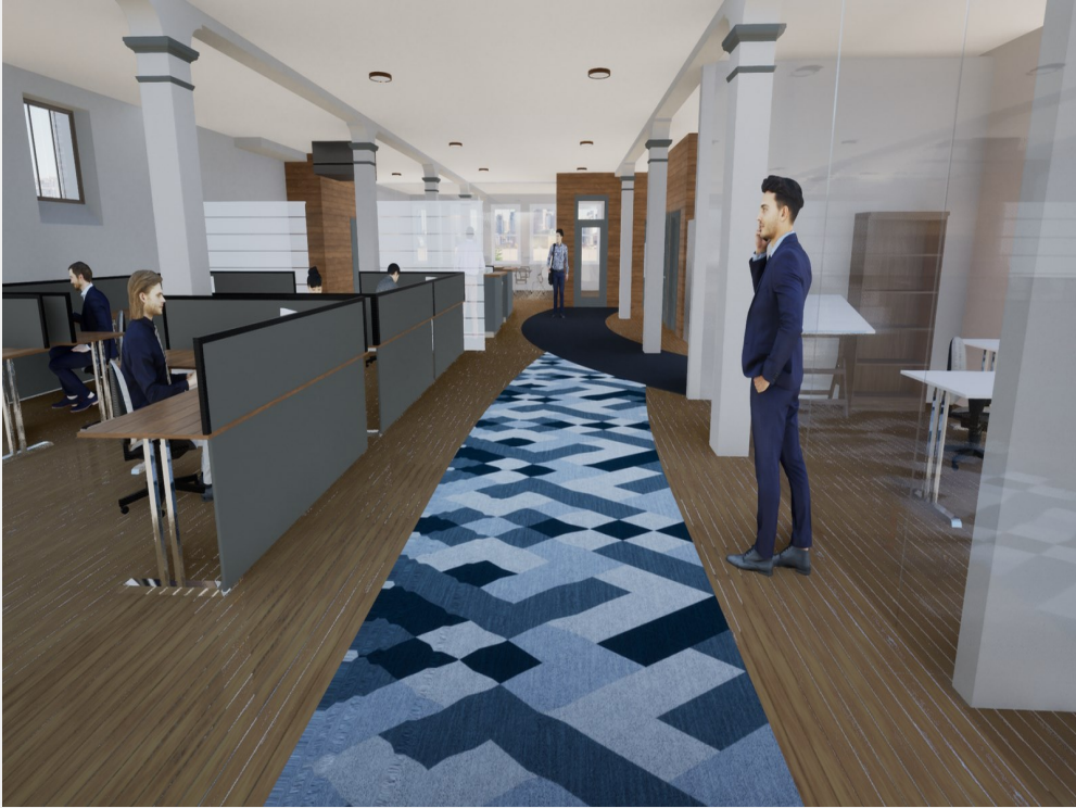
3rd Floor Rendering-2