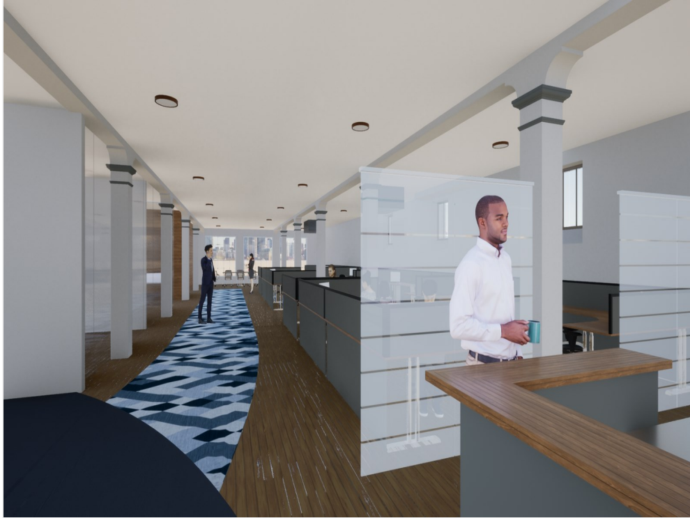
3rd Floor Rendering-3