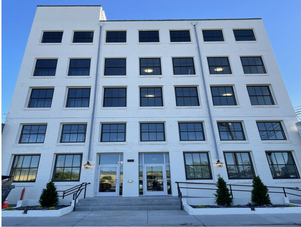
Purpose - Rear Entrance