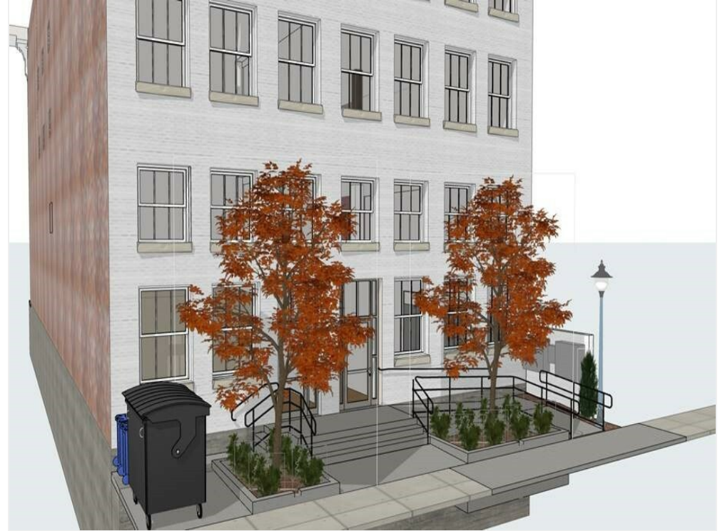
Purpose - Back Entrance