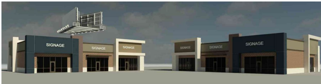
PARKING LOT ELEVATIONS