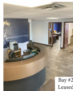
Bay #2 Leased