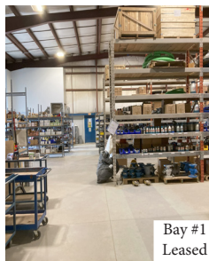
Bay #1 Leased