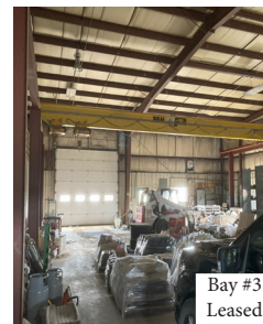
Bay #3 Leased