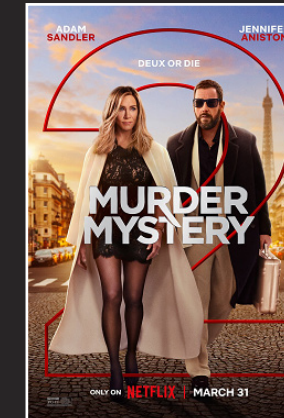
MURDER MYSTERY 2