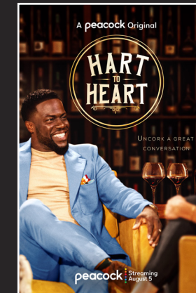
HART TO HEART