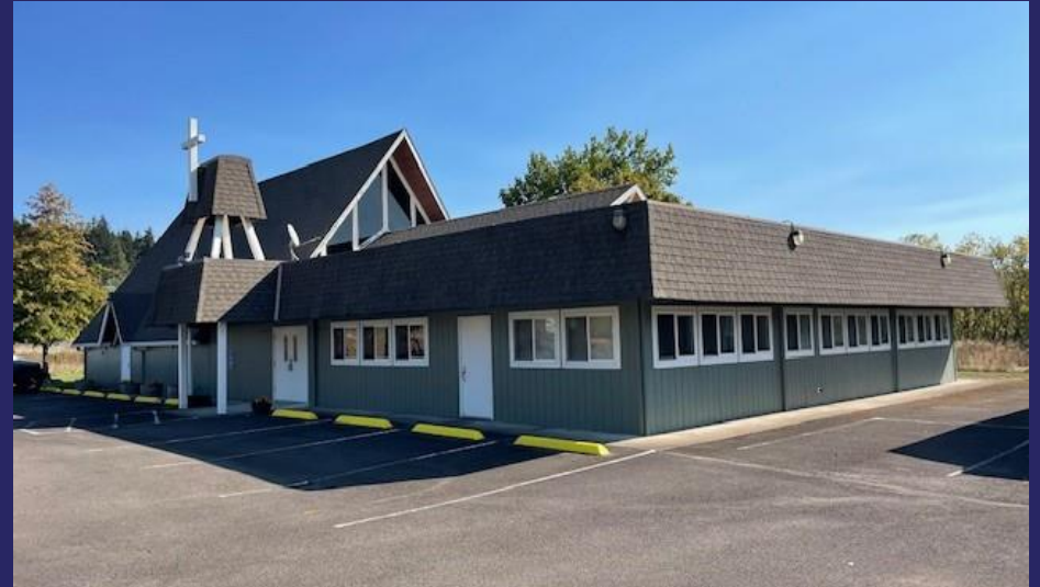
Sunday School Wing