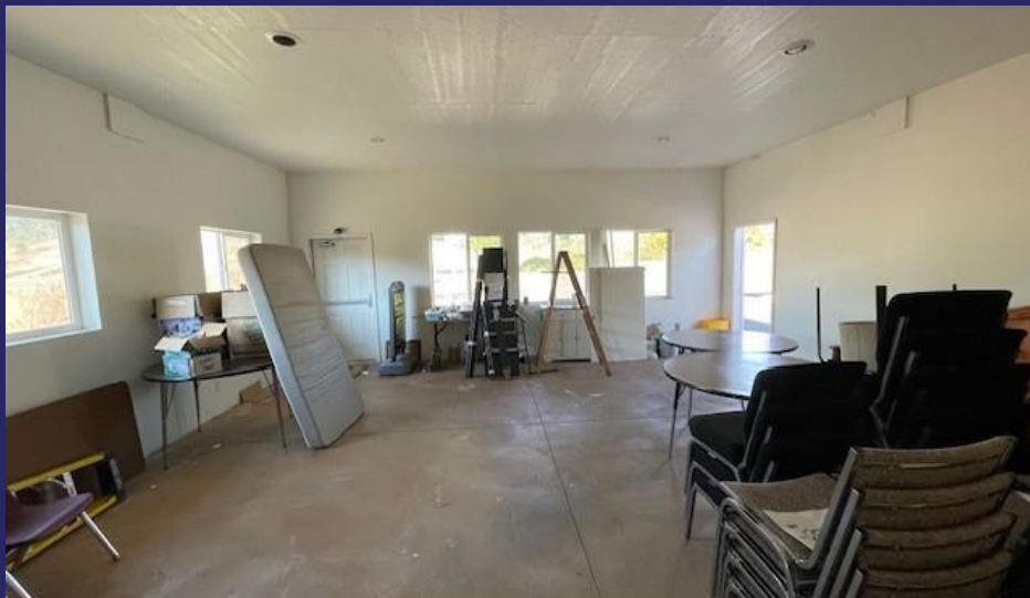
Auxiliary Building/Meeting Space