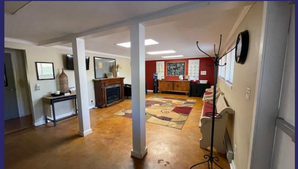
Entry Way / Foyer