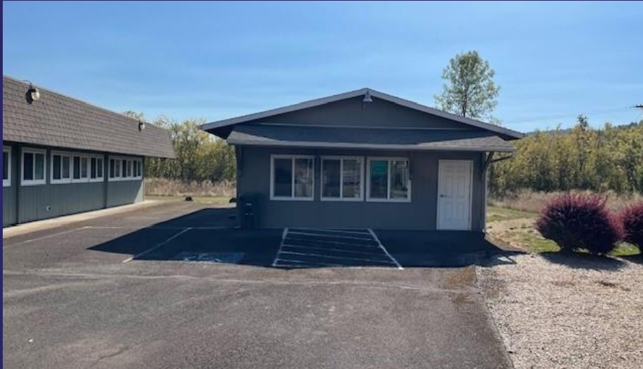
Auxiliary Building/Meeting Space