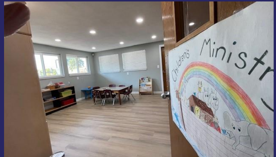
Sunday School Classroom