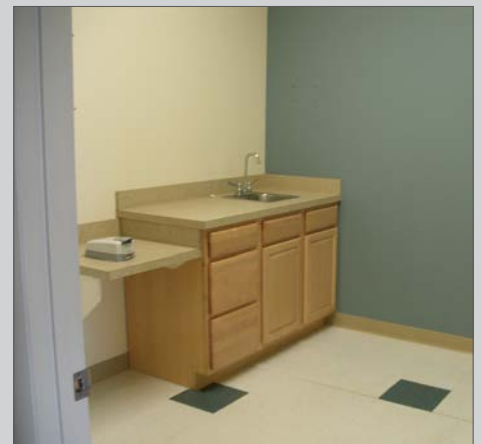
Exam Room 2