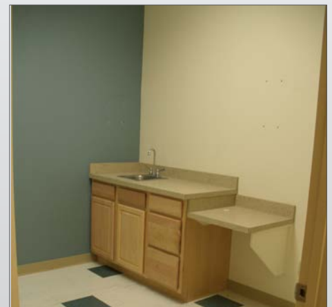
Exam Room 1