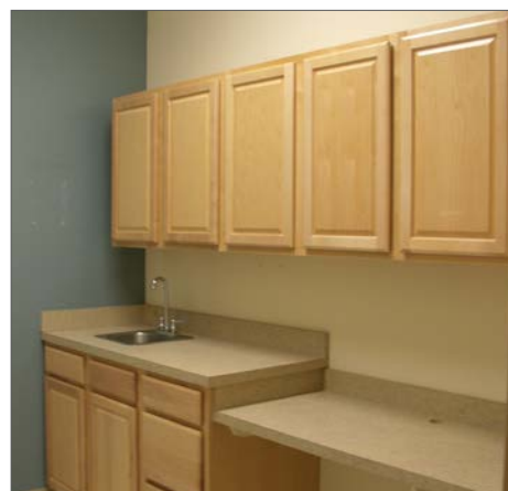
Exam Room 3