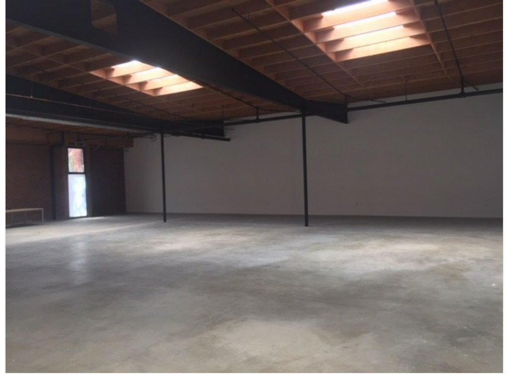
unit 105- inside space