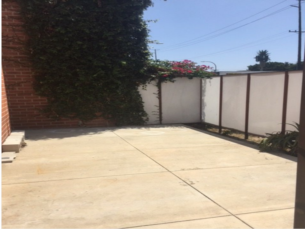
105 - Patio/Lounge Area