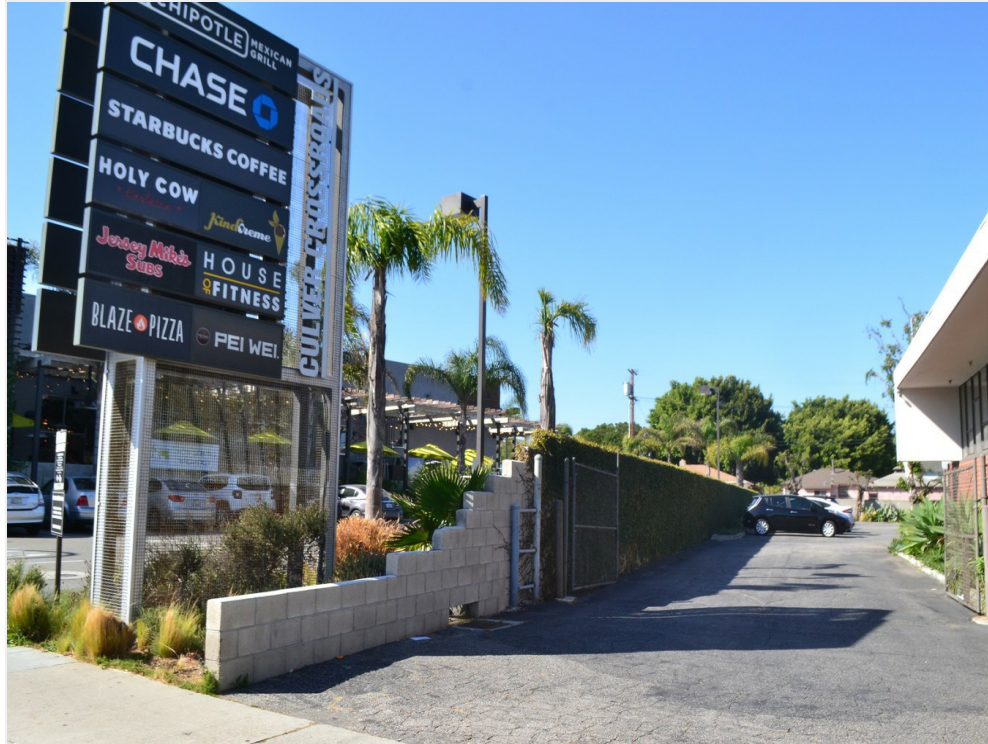
Amenities next door