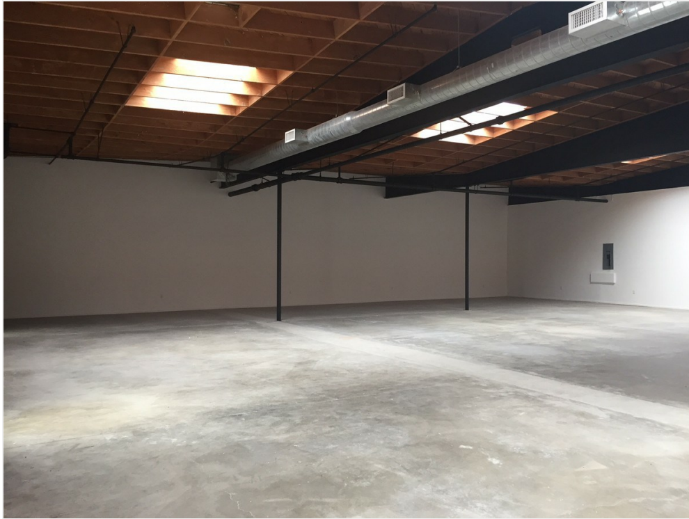
unit 105 - all open