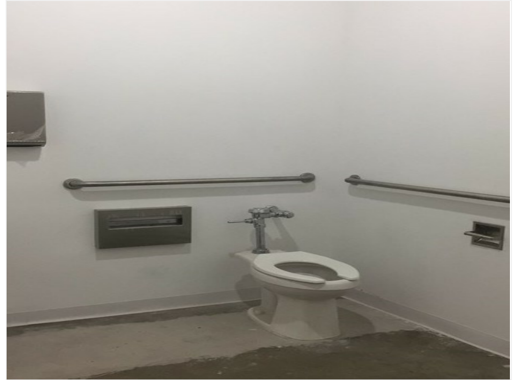
unit 105 - 2 large ADA bathrooms