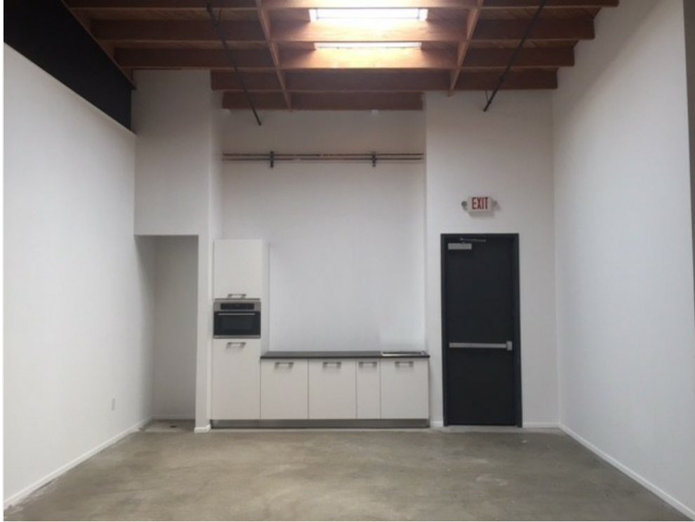
unit 105 - kitchen area