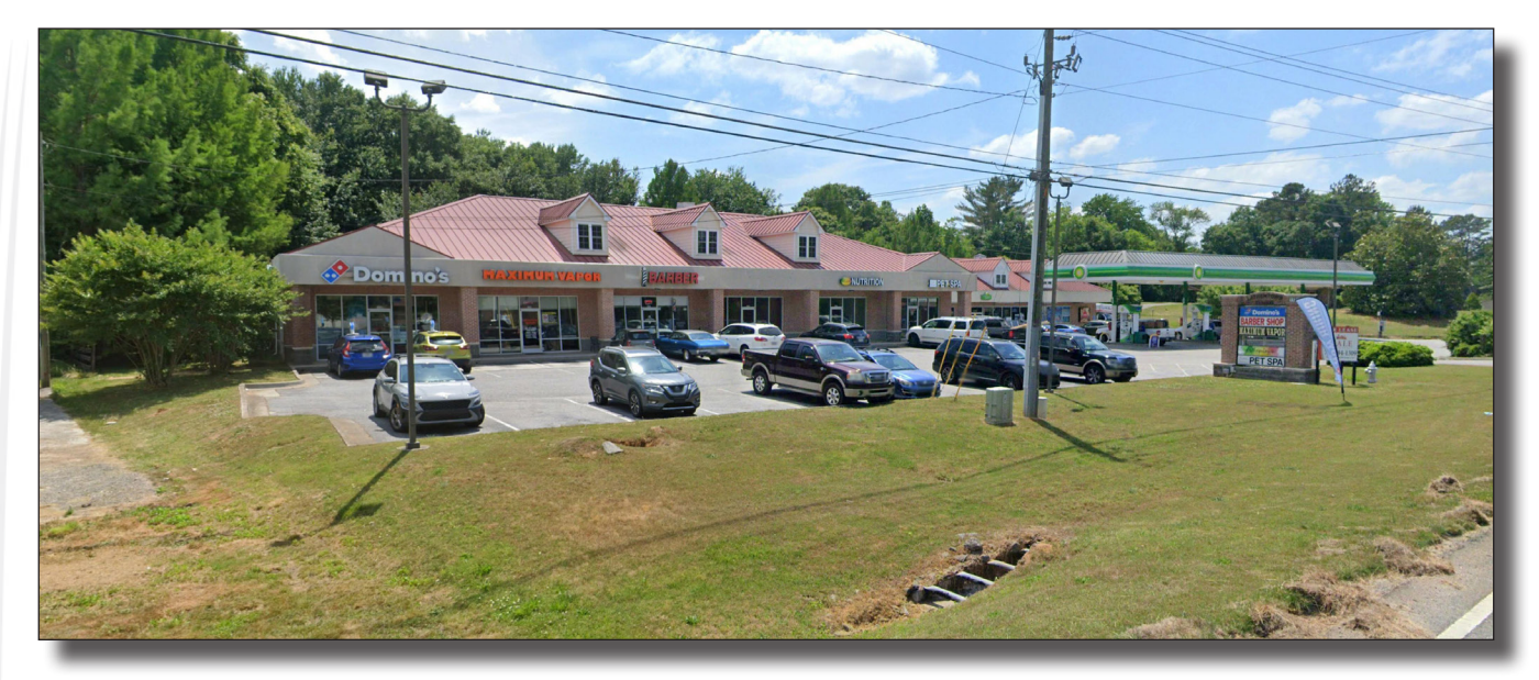
11242 Cumming Highway, Canton, Georgia 30115

Located on Heavily Trafficked Cumming Highway/Georgia 20