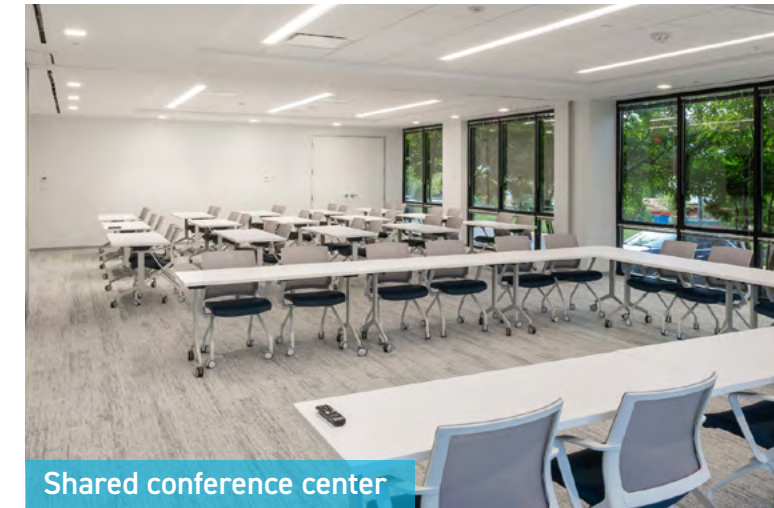
Shared conference center