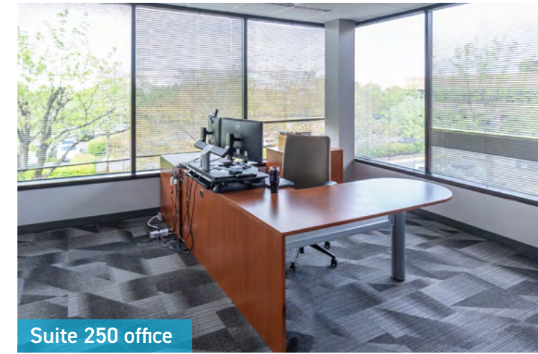
Suite 250 office