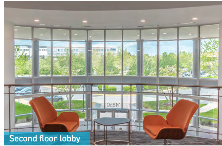
Second floor lobby