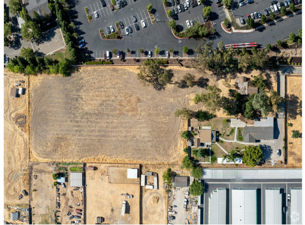
90° Look Down