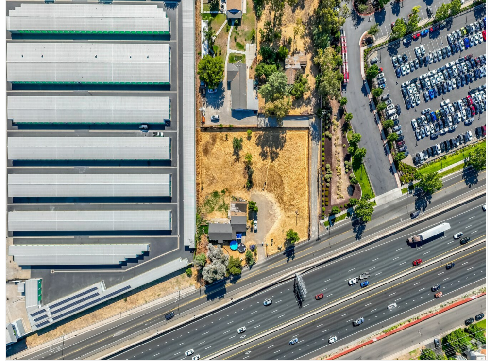
90° Look Down